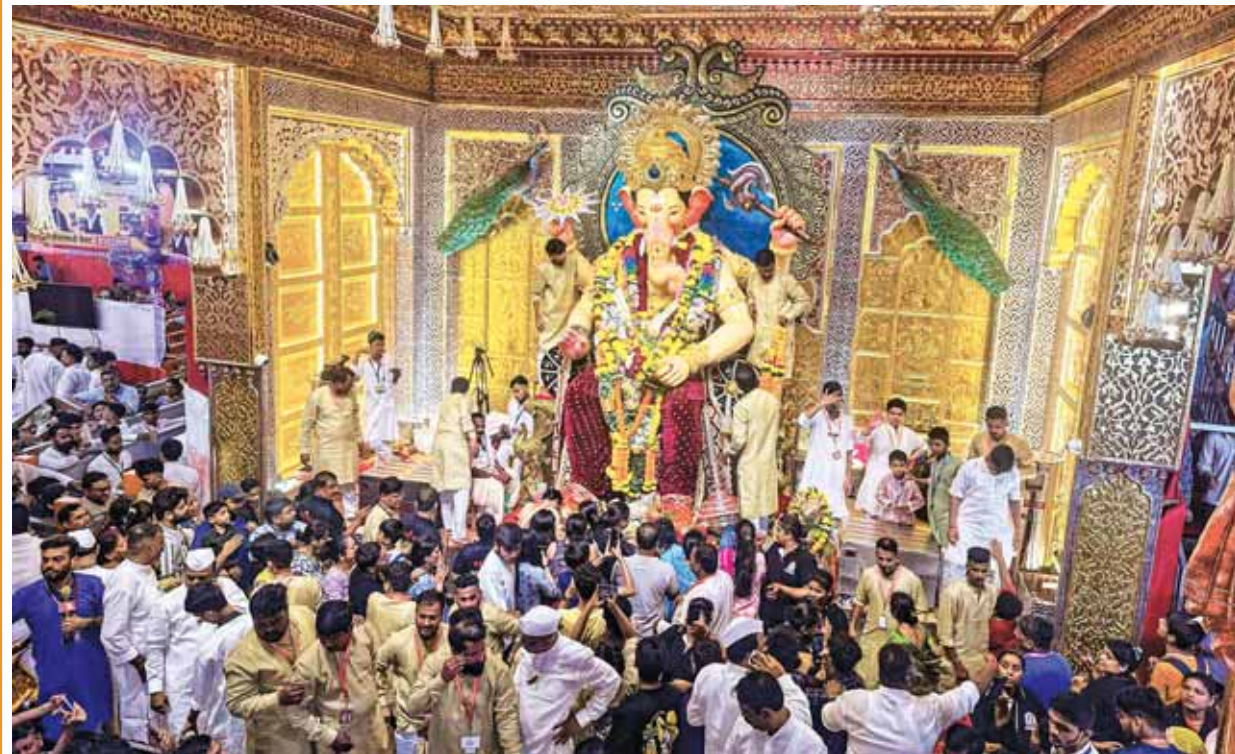
Mumbai: Devotees offer prayers to Lord Ganesh at the Lalbaugcha Raja on Ganesh Chaturthi festival, in Mumbai, Saturday