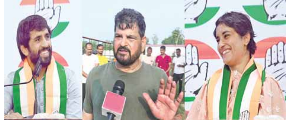
(Left to right) Bajrang Punia, Brij Bhushan and Vinesh Phogat