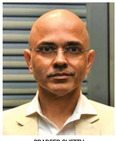
PRADEEP SHETTY President, Federation of Hotel and Restaurant Associations of India (FHRAI)

How do you view the current and future employment trends in the hospitality sector? Despite challenges posed by the COVID-19 pandemic, the hospitality sector is expected to rebound strongly. The India Food Services Report-2024 projects that by 2025, the sector will employ approximately ten million people. The industry's resilience, coupled with advancements in accommodation and government initiatives to promote tourism, supports its significant role in job creation.