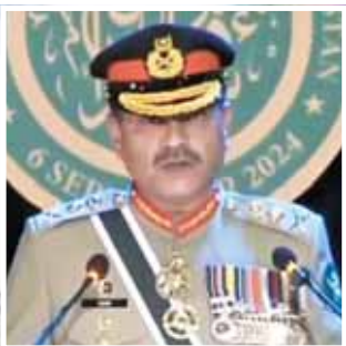
Pakistan Army Chief General Asim Munir admits Pak army's role in Kargil war, says several Pak soldiers died in the 1999 Kargil War against India