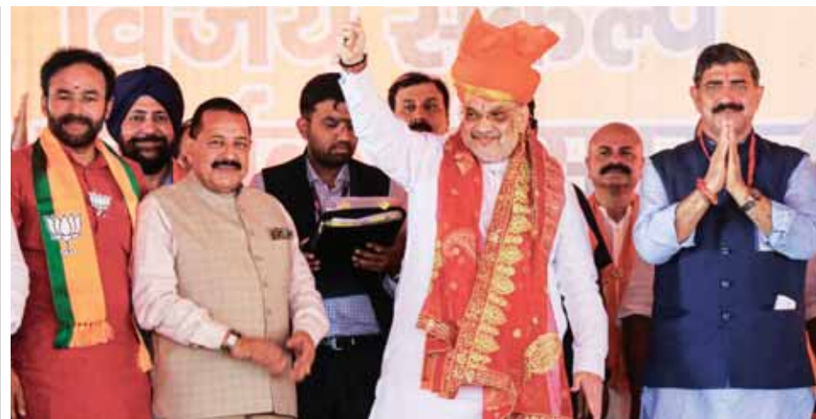
Union Home Minister Amit Shah during a party worker meet ahead of Jammu and Kashmir Assembly elections, in Jammu, Saturday, Sept. 7, 2024. MoS Jitendra Singh was also seen

Prime Minister Nawaz Sharif to order the withdrawal of Army personnel from the Kargil sector. The day is observed as 'Kargil Vijay Diwas' to commemorate India's victory over Pakistan in the war. A total of 545 soldiers laid down their lives fighting the Pakistani intruders. India has always maintained the operation was a strategy by Pakistan to assert its claim over Kashmir. India has several evidence of involvement of the Pakistani army in Kargil, including prisoners of war, their pay books, uniforms, and weapons. The Indian Army buried several dead Pakistani soldiers in Kargil after the war. The Pakistani Army had refused to accept the bodies of soldiers killed in Kargil. The authorities had secretly sought bodies of Pakistani officers killed in the war. India has consistently asserted that the conflict was a direct act of aggression by the Pakistani military. The Pakistani army's intrusion into Kargil with terrorists as a cover became evident from the intercepted conversation between General Pervez Musharraf (while visiting Beijing) and his Chief of General Staff Lt Gen Mohammed Aziz in Rawalpindi on May 26 and May 29.