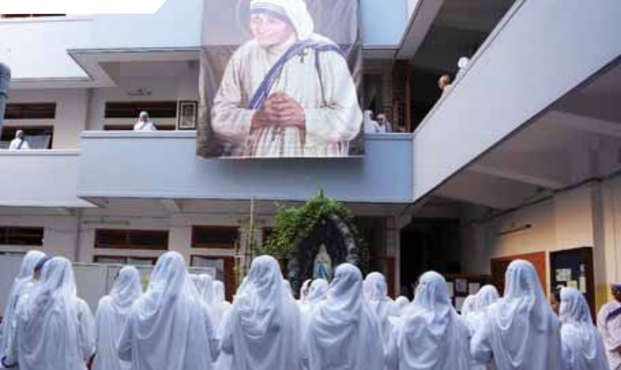
Nuns offer prayers during observance of the death anniversary of Mother Teresa, in Kolkata