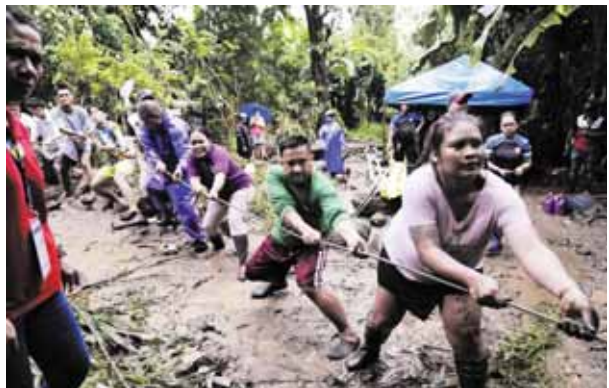
Volunteers and rescuers pull a rope to move debris during search and rescue operations for missing residents after a landslide caused by Tropical Storm Yagi, locally called Enteng, hit their village at San Luis, Antipolo city, Rizal province, Philippines on Tuesday.

It was forecast to strengthen into a typhoon as it barrels north-westward over the sea toward southern China. Storm warnings remained in most northern Philippine provinces, where residents were warned of the lingering danger