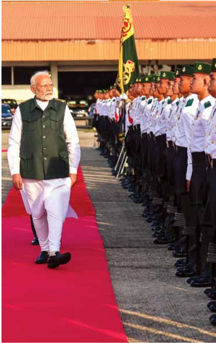
PM receives a ceremonial welcome in Brunei on Tuesday