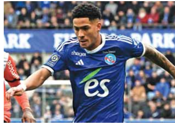
permanent deal to Al Nassr - where Cristiano Ronaldo where Cristiano Ronaldo the move was announced a day after the Saudi transfer window shut and will help