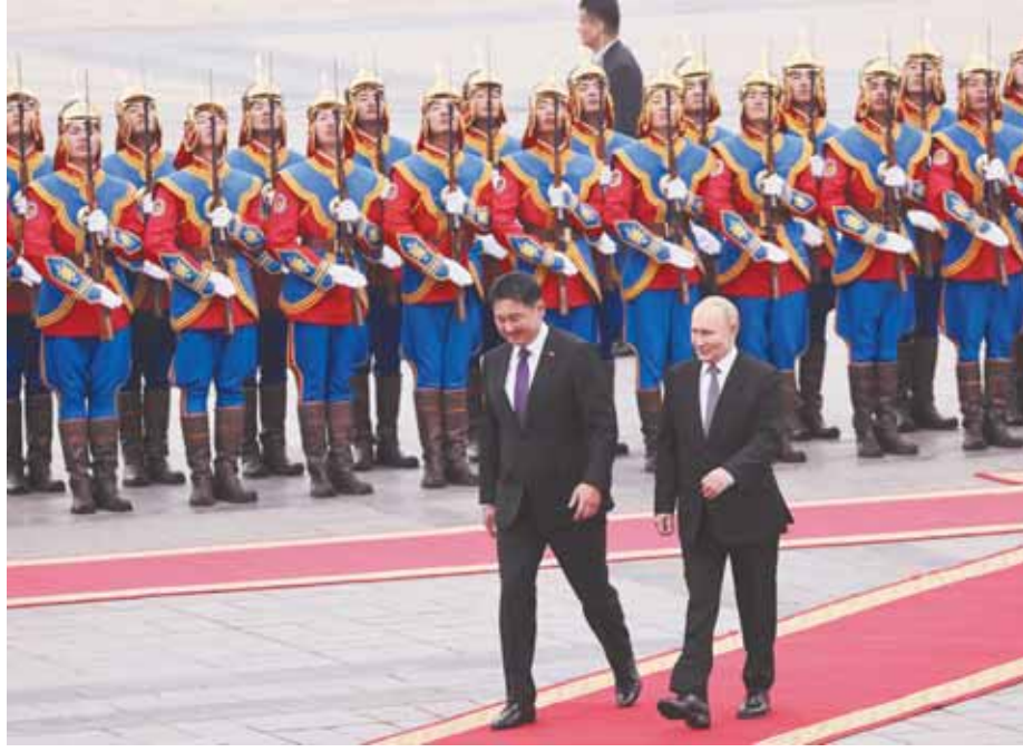
Russian President Vladimir Putin, right, walks with Mongolian President Ukhnaagiin Khurelsukh, left, during welcoming ceremony at Sukhbaatar Square in Ulaanbaatar, Mongolia, Tuesday.

A spokesperson for Putin said last week that the Kremlin wasn't worried. The warrant puts the Mongolian government in a difficult position. After decades under communism with close ties to the Soviet Union, it transitioned to democracy in the 1990s and has built relations with the United States, Japan and other new partners. But it remains economically dependent on its two much larger and more powerful neighbours, Russia and China. Russia supplies the landlocked country with most of its fuel and a sizeable