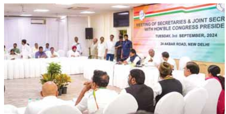
Leader of Opposition in Lok Sabha and Congress MP Rahul Gandhi with party president Mallikarjun Kharge and party MP KC Venugopal during meeting with party secretaries and joint secretaries, in New Delhi, on Tuesday

Ironically, the State Congress leaders in Haryana have rejected the possibility of any alliance with AAP in the State. Recently, senior