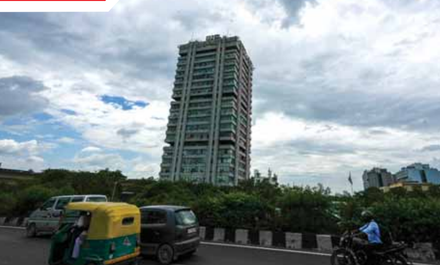
Clouds hover over the Delhi as vehicles pass by the Vikas Minar, in New Delhi