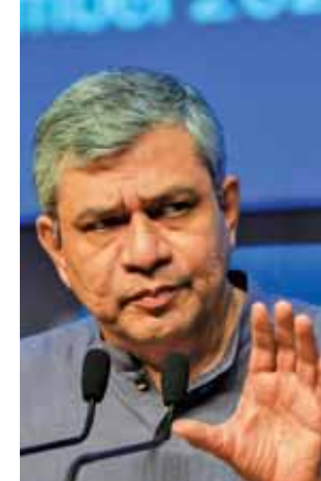
Union Minister Ashwini Vaishnaw briefs the media over cabinet decisions, in New Delhi, Monday

In an effort to improve the lives of farmers and increasing their income, the Union Cabinet chaired by Prime Minister Narendra Modi on Monday approved around ₹13,966 crore outlay for seven big-ticket programmes related to the farming sector, including a ₹2,817-crore digital agriculture mission and a ₹3,979-crore scheme for crop science. These programme will focus on harnessing public-funded digital infrastructure to research focussed on emerging challenges in the farm sector. The emphasis of these programmes would be on research & education, climate resilience, natural resource management and digitisation in the agriculture sector along with emphasis on growth of horticulture and livestock sectors. Addressing a press conference after the Union Cabinet meeting, Union Minister Ashwini Vaishnaw announced that the Union Cabinet, chaired by Prime Minister Narendra Modi, approved seven schemes to improve farmers' lives and increase their incomes at a total outlay of ₹13,966 crore. The Cabinet has approved crop science for food and nutritional security programmes with a total outlay ₹3,979 crore. In this programme, six pillars have been included in the programme with a