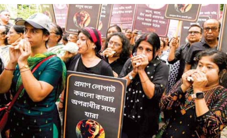
Ramkrishna Mission alumni wearing black dresses blow conches during a protest rally demanding justice for the victim of R G Kar Medical College and Hospital incident, in Kolkata, on Sunday