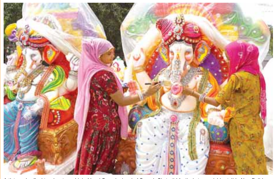
Artists give final touches to an idol of Lord Ganesha ahead of Ganesh Chaturthi festival at a roadside stall in New Delhi on Sunday