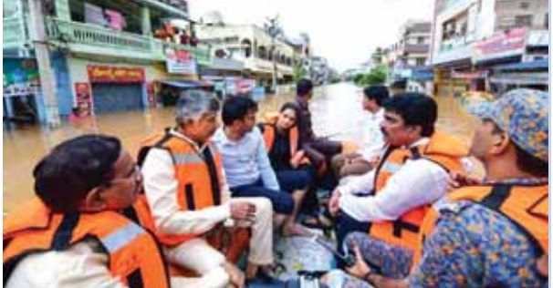
Andhra Pradesh Chief Minister N Chandrababu Naidu with others during a visit to a flood-hit area in Vijayawada