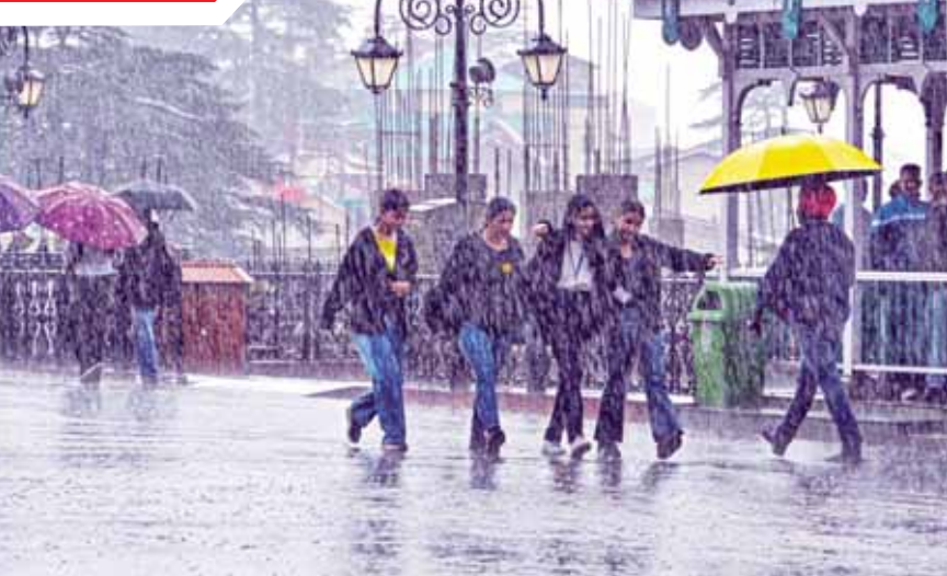
People walk down a road during rain, in Shimla.