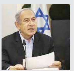
doesn't want a deal," he said. Critics in Israel have accused Netanyahu of dragging his feet in cease-fire talks — a charge he denies.

Jerusalem: Israeli Prime Minister Benjamin Netanyahu has expressed sorrow over the deaths of six hostages, saying the killings prove that Hamas does not want a cease-fire deal. Netanyahu said Sunday that he was heartbroken to hear the news of the hostages' deaths. He accused Hamas of killing them in "cold blood" and said Israel would hold the group accountable. He also accused the group of scuttling ongoing cease-fire efforts. "Whoever murders hostages