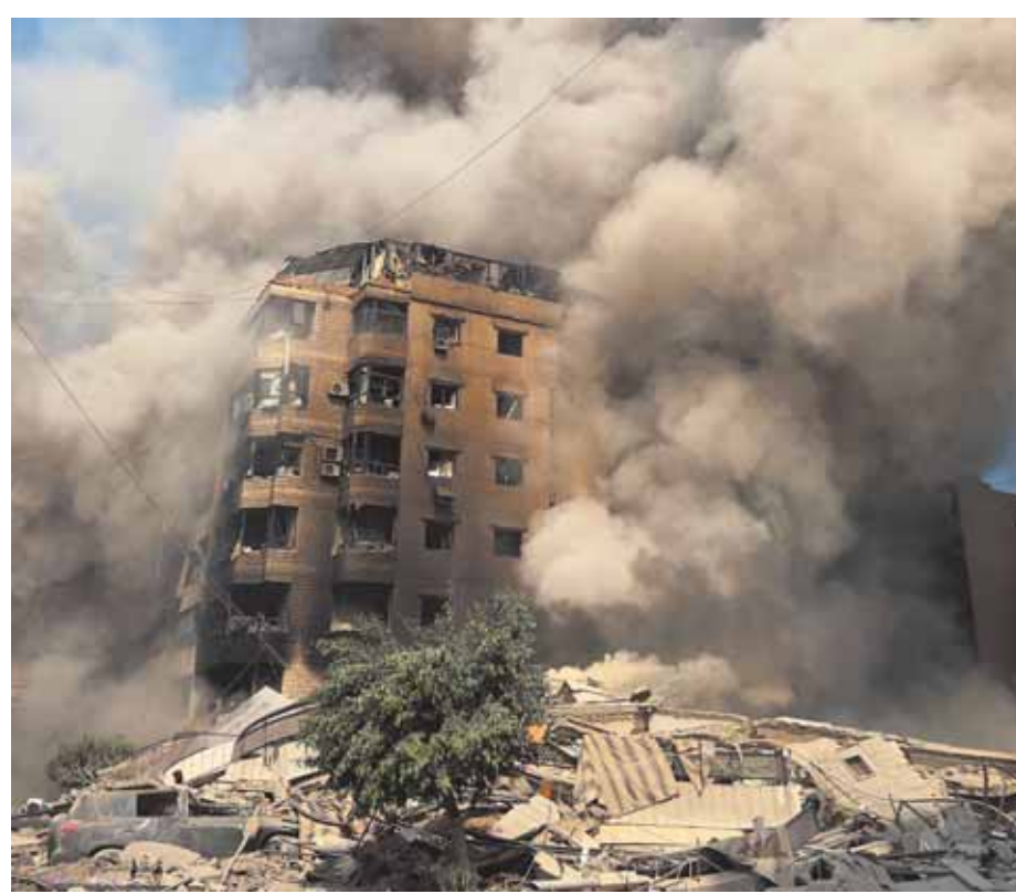
Smoke rises as a building collapses in Beirut's southern suburbs on Saturday.

A prominent general in Iran's paramilitary Revolutionary Guard died in an Israeli airstrike that killed Hezbollah leader Hassan Nasrallah in Beirut, Iranian media reported Saturday. The killing of Gen. Abbas Nilforushan marks the latest casualty suffered by Iran as the nearly yearlong Israel-Hamas war in the Gaza Strip teeters on the edge of becoming a regional conflict.