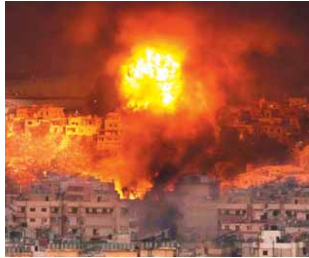
Flames rise after an Israeli airstrike in the southern suburbs of Beirut, Lebanon, Saturday