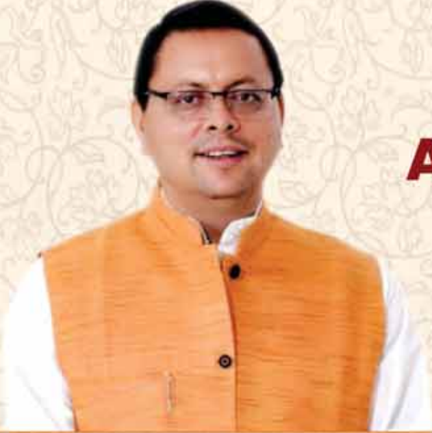
Pushkar Singh Dhama Chief Minister, Uttarakhand