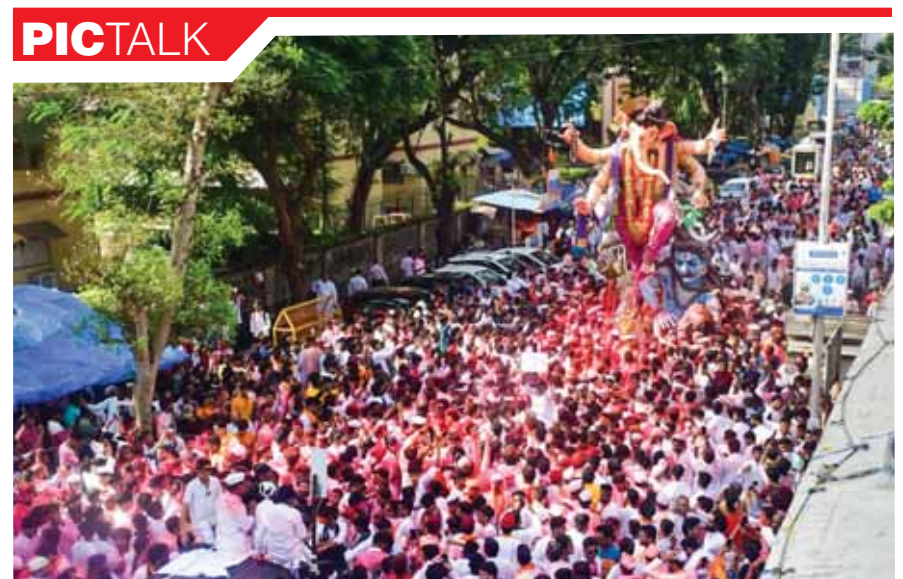
Devotees take part in a procession to immerse an idol of Lord Ganesha at the end of the Ganpati festival, in Mumbai

benefited 12 crore farmers. The GENESIS program was launched to support startups in Tier-II and Tier-III cities, alongside a Rs 2 lakh crore package for youth employment, targeting 41 million over five years. Women empowerment saw the recognition of over 1 crore 'Lakhpati Didis.' On security front, a peace deal was brokered in Tripura, and steps were taken to counter cybercrime with initiatives like the 'Samanvay' platform and a Cyber Fraud Mitigation Center. Despite big ticket announcements and policy decision the Government will have to be mindful of the challenges that must be addressed immediately. Despite a development push, India faces rising inflation, particularly in food prices, affecting the average citizen. The political climate has become increasingly polarised. The government is facing opposition over economic policies, controversial legislative moves like the Uniform Civil Code, and rising social tensions. The upcoming assembly elections, especially in Jammu and Kashmir would be a referendum of its policies. The Government did well to built upon the successes of its earlier terms, but now it faces new challenges that demand nuanced responses. From fortifying India's global position to tackling domestic concerns like inflation, economic growth, and social unity, the Government's approach will be crucial for shaping the future of the nation.