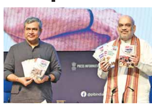
Union Home Minister Amit Shah with Minister of Railways, Ashwini Vaishnaw at the release of a special booklet on achievements of first 100 days

Asked about the possible visit of Prime Minister Narendra Modi to Manipur, Shah said, when he visits the State, it will