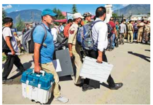
Polling officials leave for their respective polling stations on the eve of first phase of the Jammu and Kashmir Assembly election, in Kishtwar district, Tuesday