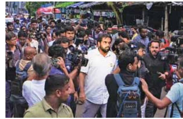
A delegation of junior doctors moves to board a bus from their dharna site near Swasthya Bhawan for a meeting with West Bengal Chief Minister Mamata Banerjee at her Kalighat residence, in Kolkata, West Bengal, Monday