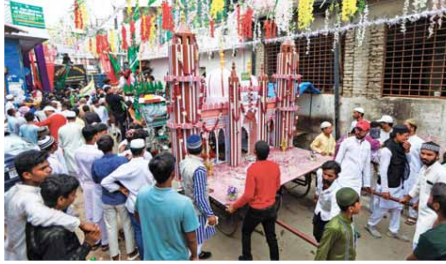
Muslims take part in an Eid-e-Milad-un-Nabi procession in Prayagraj, Monday, September 16, 2024 PTI