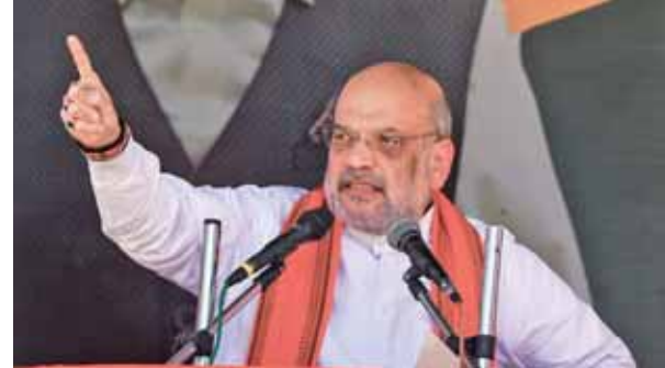
Union Home Minister Amit Shah speaks during a public meeting ahead of J&K Assembly elections, in Kishtwar district, Jammu & Kashmir, Monday

Launching a frontal attack on the pre-poll alliance partners, Congress and the National Conference on the last day of campaigning in Kishtwar, Union Home Minister Amit Shah on Monday appealed to the voters in the region to punish these parties by voting in favour of the BJP as they (Congress-National Conference) have always "nurtured and nourished" terrorism. Shah vowed to "bury terrorism deep into the earth so that it would not be able to rear its head again." Addressing three back-to-back election rallies in the region Shah said there is a clear fight between the Congress-National Conference alliance and the BJP — one wanting to bring back Article 370, and the other committed to stopping it. Shah reiterated the Constitution's Article 370, which gave special status to J and K, is history and will never come back. The Home Minister also paid tributes to all those who have been killed in terror-related incidents, and specially referred to the deaths of BJP leaders Anil Parihar, Ajit Parihar and RSS leader