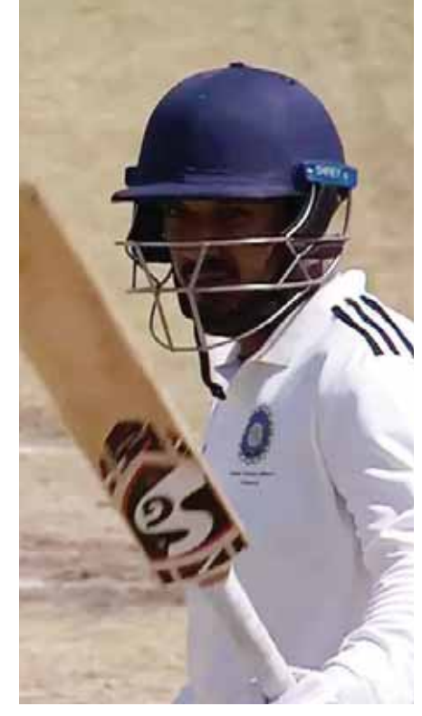
PTI ■ ANANTAPUR