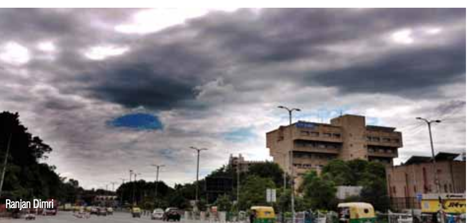
Central India received 1068.5 mm as against normal of 906.8 mm rainfall, which is 18 per cent more so far. South Peninsula received 759.8 mm rainfall as against the normal of 631.5 mm, around 20 per cent more this year. The torrential downpour across Delhi for the past few days has surpassed both annual and seasonal average rainfall in September in the national Capital. According to the India

Gangetic West Bengal. The India Meteorological Department (IMD) data showed India, this monsoon has received 857.5 mm rainfall as against the normal of 795.9 mm so far. Notably, Arunachal Pradesh, Nagaland, Punjab and Chandigarh are among the rain deficit States and two weeks left for departure of monsoon this year. Data showed East and North-East sub division has received 1047 mm rainfall as against the normal of 1233.9 mm, a deficit of 15 per cent so far; North-West India including Jammu and Kashmir, Ladakh, has received rainfall of 590.9 mm as against the normal of 552.5 mm, around 7 per cent more this season.