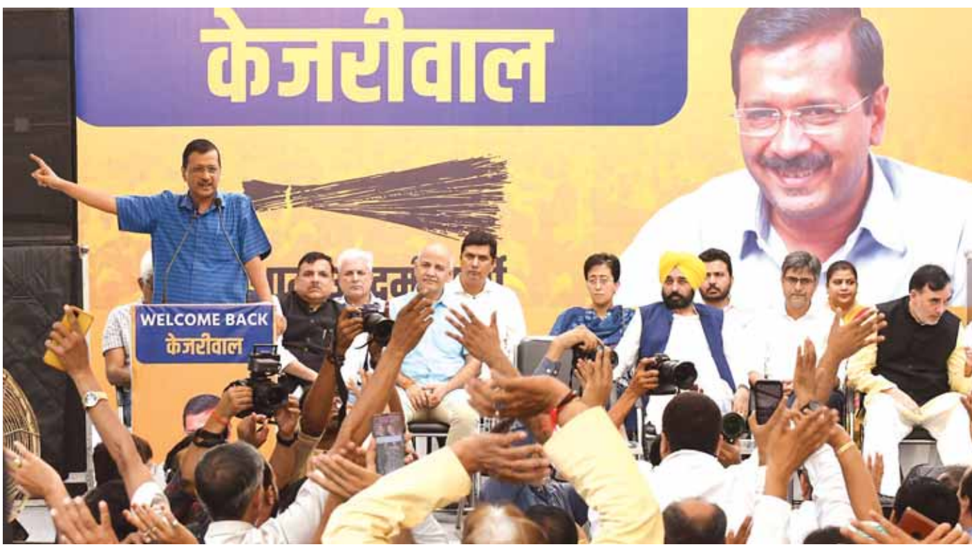
Delhi Chief Minister Arvind Kejriwal with other AAP leaders wave during a party workers' meeting, in New Delhi on Sunday