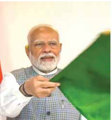
Prime Minister Narendra Modi flags-off Tatanagar-Patna Vande Bharat train in Jamshedpur, through Video conferencing, Sunday

"You people might be thinking I have just come out of jail, why is he going to resign. They have raised allegations against me... They are saying that SC has put conditions on bail. After I resign, AAP will hold a high level meeting and decide a name for CM post," Kejriwal said while addressing party workers at his new headquarters. He said, "Despite the court giving us bail, the case will continue. I spoke to my lawyers. Till the case does not end, I will not sit on the CMs seat. After two days, I am going to resign from the post of CM. I will not sit on the CM's seat till the people elect me and send me to the seat again." Kejriwal alleged that the probe agencies sent him to jail to break his spirits, and the party. "Why did they send me to jail? It was not like I had committed any crime. They also know this. They just want to break my spirit, break my party, poach our Leaders, Ministers... send ED, CBI to torture our Leaders. But our Leaders and workers did not break. But I want to tell you today that they strengthened me by sending me to jail," he said. AAP convener added, "Both Sisodia and I were also stressing about this. He will also not hold any charge. We both will assume our seats when people will reelect us." The AAP national convener said, "I will become Chief Minister and Manish Sisodia deputy CM only when people say we are honest. Kejriwal said he would hold a meeting of AAP MLAs in the next couple of days and a party Leader would take over as Chief Minister.