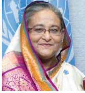
Awami League government, The Daily Star newspaper reported. With this, the tally of cases against Hasina has reached 155, including 136 for murder, seven for crimes against humanity and genocide, three for abduction, eight for attempted murder and one for