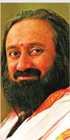
Sri Sri Ravi Shankar Spiritual Guru

Prayer is a vital tool to improve your life. Wherever you can put your effort, put it. Where you cannot, pray for it! Whatever you do, know that a Higher Power has the final say and you can tap that power through your prayers.