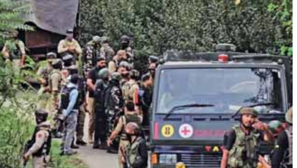
Security personnel during an encounter with militants at Chak Tapper Kreeeri Pattan area, in Baramulla district, Jammu and Kashmir, Saturday

Ahead of the maiden visit of Prime Minister Narendra Modi to address an election rally in the land-locked Doda district on Saturday, two soldiers of the Indian army sacrificed their lives while two others received injuries during a counter-terrorism operation in the Chatroo area of Kishtwar on Friday. In another overnight operation launched in the kreeeri area of North Kashmir's Baramulla district, three terrorists were gunned down by the joint team of security forces on Saturday. The security forces were able to neutralise a group of hiding terrorists after identifying their exact locations inside the building with the help of drone cameras. With this, the number of terrorists eliminated in the last three anti terrorist operations have gone up to seven. Chinar Corps of the Indian army in a post on X confirmed, "Three terrorists have been neutralised by the security forces in the ongoing Operation. Weapons and warlike stores have been recovered. The Chinarcops has dealt some crippling blows to the terror network in North Kashmir over the past few days with significant recoveries and elimination of terrorists, inspiring confidence and assurance for upcoming events scheduled in the region." Before the day ended, another