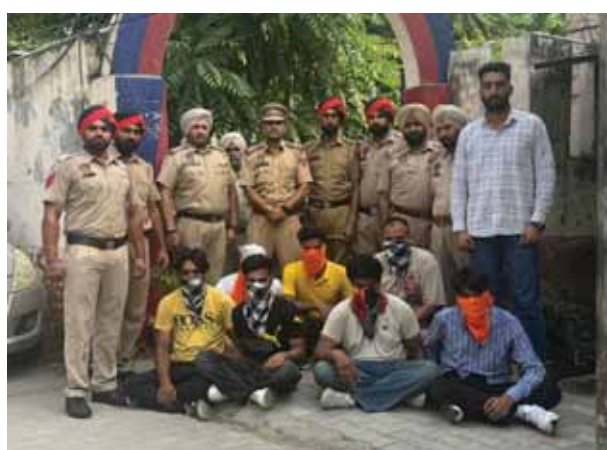
Seven live cartridges and 1000 Alprazolam tablets from their possession, besides, impounding a white Venue car (PB-08-EZ-2018), on which they were travelling.

Police teams have also recovered four pistols— including two .30 bore pistols, one .32 bore pistol and one .315 bore country-made pistol along with