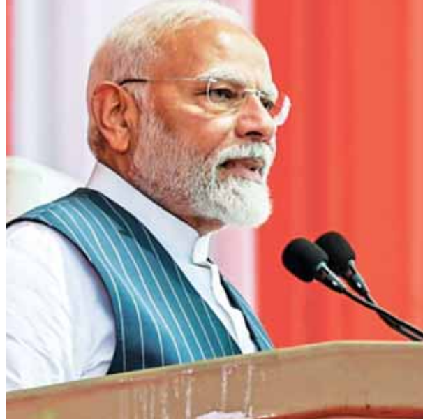
Prime Minister Narendra Modi addresses a public meeting ahead of the upcoming Jammu and Kashmir Assembly elections, in Doda district, Saturday

Counting the sins committed by three dynastic families namely Congress, National Conference, and the Peoples Democratic Party Prime Minister Narendra Modi said on Saturday, the upcoming Assembly elections in Jammu and Kashmir will be a fight between these "three dynasties" and the youth of the Union Territory. Modi also asserted that terrorism is taking its last breath in Jammu and Kashmir and will be completely wiped out by the security forces. Before the arrival of the Prime Minister, jawans of the security forces were engaged in an intense firefight in the Kreeeri area of Baramulla. Three terrorists were gunned down in the anti-terrorist operation. Since September 9, a total number of seven terrorists were eliminated in three separate operations while two bravehearts of the Indian army sacrificed their lives in the line of duty. On the occasion, Modi reiterated his Government's promise of restoring statehood to Jammu and Kashmir and cautioned people against bringing the NC, Congress, and the PDP back to power. The Prime Minister while addressing his maiden election rally ahead of the