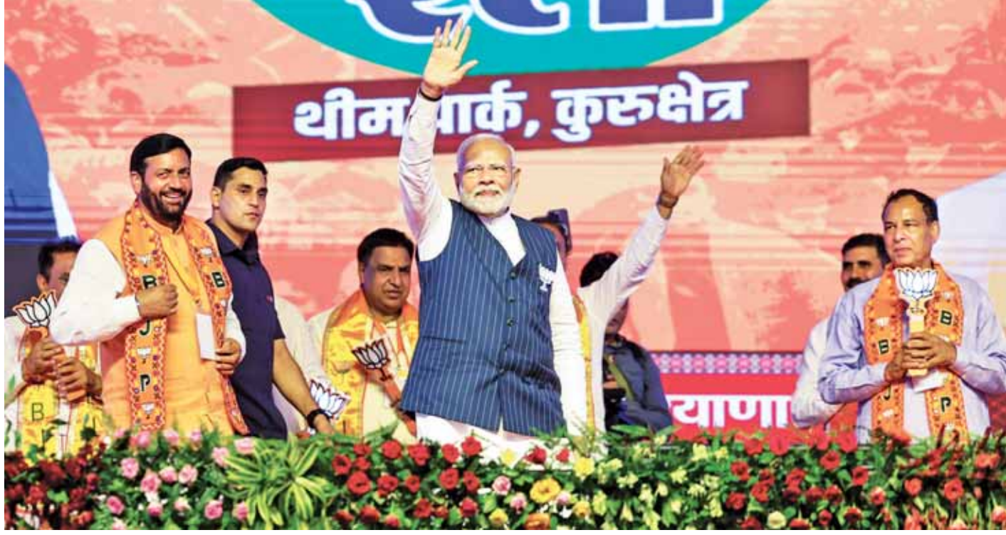
Prime Minister Narendra Modi with Haryana Chief Minister Nayab Saini and others during a public meeting ahead of the upcoming Haryana Assembly elections, in Kurukshetra, Saturday

"The Congress made hue and cry over Minimum Support Price (MSP). I ask them how many crops they buy at MSP in Congress ruled States- Karnataka and Telangana? Those who trusted Congress are now regretting it. Their only agenda is to empty public coffers to win elections. Just witness the condition of Punjab. The people of Haryana must keep such parties far from power," Modi said. "Did any farmer receive money in their accounts during Congress rule?" Prime Minister asked. Polling for the 90 Assembly seats in Haryana will be held on October 5 and the votes will be counted on October 8. Addressing the rally, Modi said, "Two years ago, the Congress Government was formed in Himachal Pradesh. But what is the situation there today? No citizen of Himachal is happy today. Congress fed lies to every section there but none of the promises made were fulfilled." Under the Kissan Samman Nidhi, more than Rs 3.25 lakh crore has been deposited in farmers' accounts, he said while highlighting his Government achievements. "See what is happening in Karnataka. During a short period of Congress' rule in that State, about 1,200 farmers have committed suicide there," the Prime Minister said. The Prime Minister added, "When the nation exposed their lies, they stopped talking about the Old Pension Scheme altogether. In contrast, BJP has introduced the New Pension Scheme, guaranteeing a secure future for employees. Government