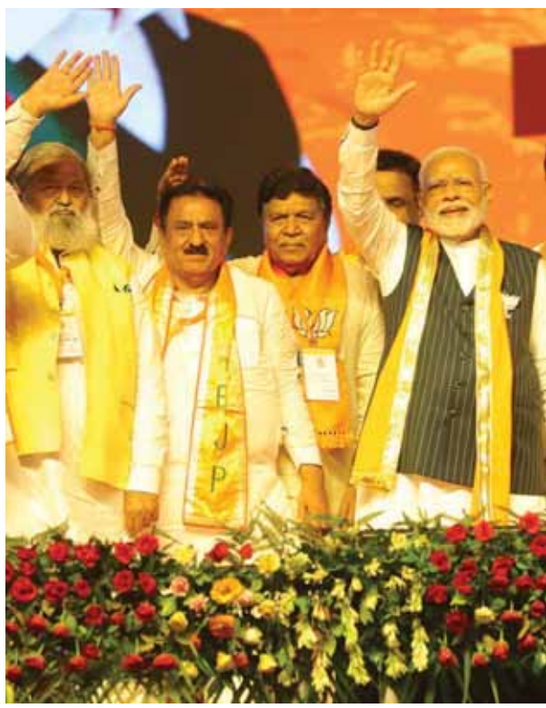
Prime Minister Narendra Modi and other BJP leaders at a campaign rally in Haryana.

People now repent voting for the Congress in these states, he said. Modi praised the Nayab Saini's government's work in Haryana. He said people gave him a third term at the Centre in the Lok Sabha elec-