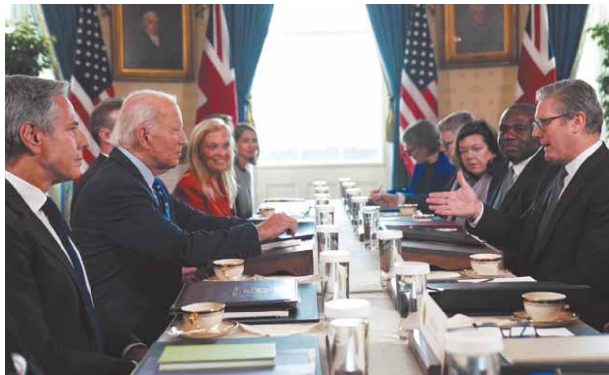
Britain's Prime Minister Keir Starmer (right) and Foreign Secretary David Lammy, second right, during a meeting with US President Joe Biden (centre left) in the Blue Room at the White House in Washington.

Iran launched a satellite into space Saturday with a rocket built by the country's paramilitary Revolutionary Guard, state-run media reported, the latest for a programme the West fears helps Tehran advance its ballistic missile programme. Iran described the launch as a success, which would be the second such launch to put a satellite into orbit with the rocket. There was no immediate independent confirmation of the launch's success, nor did Iranian authorities immediately provide footage or other details. The launch comes amid heightened tensions gripping the wider West Asia war in the Gaza Strip, during which Iran launched an unprecedented direct missile-and-drone attack on Israel.