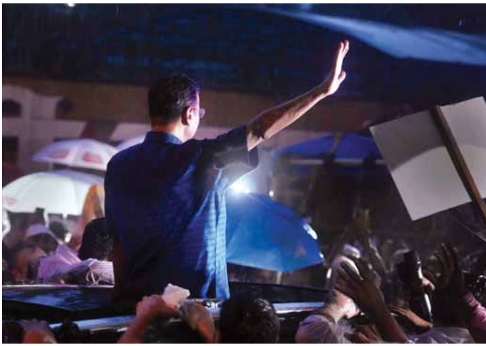
Delhi Chief Minister Arvind Kejriwal acknowledges supporters amid rainfall after walking out of the Tihar Jail, in New Delhi, Friday, Sept. 13, 2024. The Supreme Court (SC) on Friday granted bail to the AAP convener in a corruption case lodged by the Central Bureau of Investigation (CBI) in connection with the excise policy 'scam'

It also restrained him from commenting on his role in the money-laundering case against him and asked him not to interact with witnesses and / or have access to official files connected with the case. With bail conditions that do not give him complete freedom to perform his duties as Chief Minister, including that he cannot visit the Secretariat or the CM Office therein or sign any files other than those that have to be cleared by the Lieutenant Governor, officials said that the AAP Government