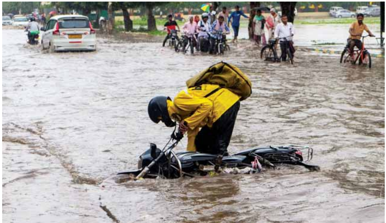
A man lifts his motorcycle after it got stuck in a pothole on a waterlogged road after rains

The sight of a submerged vehicle under Minto Bridge should now be enshrined as a "World Heritage Site" by UNESCO, because it has become such an endemic image. Not an enduring image, an endemic image, an enduring image happens once and stays forever. This image is now an annual sight, sometimes twice to thrice every season. And while it must be noted that the authorities, including the Indian railways, the custodians of the bridge have made attempts to fix the problems, it appears unfixable. But this is the issue in Delhi, we try to fix issues that we may not be able to fix instead of working out solutions to issues that can be. Like repairing and rehabilitating Delhi's sewer systems well before the storm drains and sewers get clogged with the first flush of the rains. Or to repair the roads well before the rains, instead of them becoming off-road obstacle courses and driving people to buy large SUVs instead of small cars — and this applies to all the satellite cities around Delhi as well, especially Gurugram. In fact, Gurugram, home to large multinationals and some of the richest real-estate in India, where high-