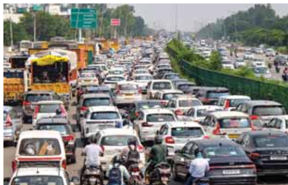
Vehicles stuck in a traffic jam on Delhi-Gurugram expressway as the service lane is closed due to construction work of the underpass between Rajokari (Delhi) to Sirhaul Border

Traffic horror persists in Delhi with heavy downpour across different parts of the national Capital and adjoining areas of Noida, Ghaziabad and Gurugram on Friday along with severe waterlogging, frequent breakdown of buses, potholes, unregulated traffic and tree falling which irked commuters as vehicles were seen moving at a snail pace on city's road. Delhi is deluged due to incessant rains since last night amid a complete collapse of civic infrastructure with disruptions of movement across the city. People complained about not being able to reach their work places due to waterlogging in different areas of the city including Mehrauli-Badarpur road, Mathura road, Sangam Vihar, Aurobindo Marg, Madhu Vihar road, Delhi Gate, Sainik Farms, India Gate, Janpath Road, Kalindi Kunj,