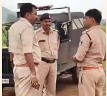
Police officers in uniform standing near a vehicle.

"The four were listening to loud music. Hearing it in the deserted area late at night, six accused reached the spot and committed the crime," Superintendent of Police (Rural) Hitika Vasal told reporters. One of the attackers threatened the