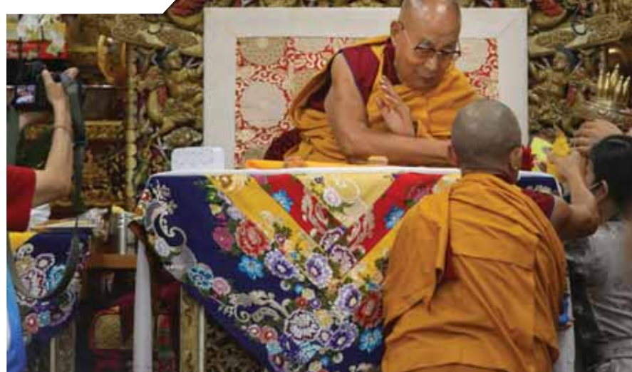
Tibetan spiritual leader the Dalai Lama during a teaching session at the Main Tibetan Temple, in Dharamshala.