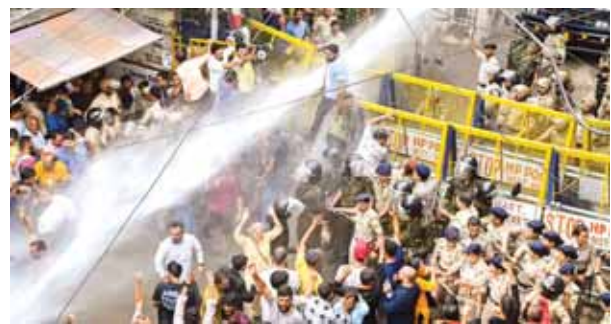
Police use water cannons to disperse protestors demanding the demolition of a mosque allegedly built on encroached land, in Mandi, Himachal Pradesh, Friday