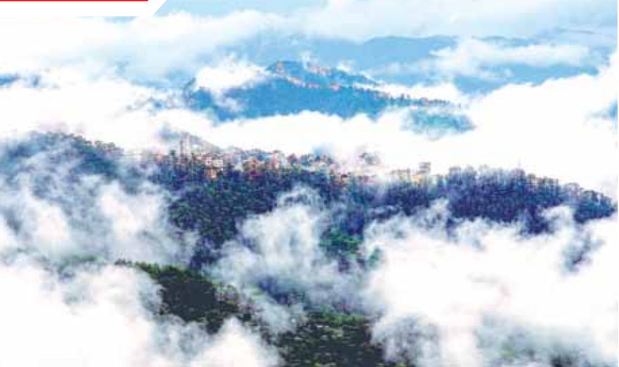
Low clouds cover the mountains after rainfall, in Shimla