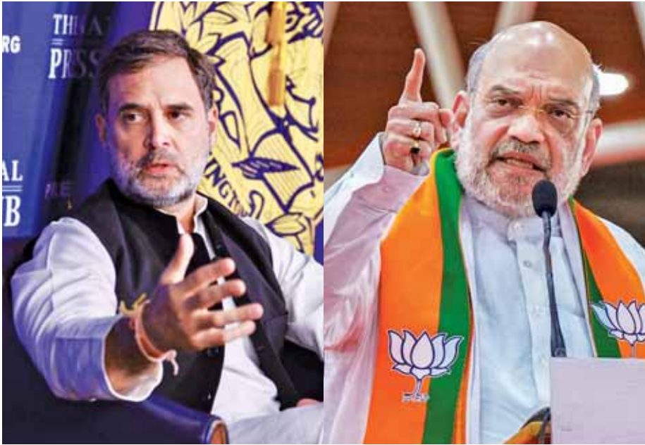
Rahul Gandhi interacts with the media at the National Press Club, in Washington DC, USA and Amit Shah condemns his anti-national statements

Yet another foreign trip by Congress leader Rahul Gandhi has stoked another round of controversy in the political circles of India and the Centre and BJP Leaders on Wednesday also commented that Rahul Gandhi's quota remark in a foreign land has exposed the Congress "anti-reservation face" and making "anti-national statements" has become a habit for the former Congress chief. Sending a stern message to Rahul Gandhi, Home Minister Amit Shah said that as long as the BJP is there, no one can abolish reservation or mess with the nation's security. The senior BJP Leader's comments came after Rahul Gandhi told students of Georgetown University in the United States that the Congress would think of scrapping reservations when "India is a fair place", which he said is not the case right now. "Standing with forces that conspire to divide the country and making anti-national statements have become a habit for Rahul