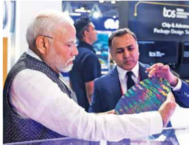
Prime Minister Narendra Modi at an exhibition during the inauguration of SEMICON India 2024, in Greater Noida, Uttar Pradesh, Wednesday

Prime Minister Narendra Modi on Wednesday called for making India a global semiconductor hub and pointed out that this is the right time to invest in India's semiconductor industry. Modi said India is well-positioned for success in this field and that the world can count on India's growing semiconductor ecosystem. Modi said that India is now the eighth country globally to host an event focused on the semiconductor industry. Speaking at the SEMICON 2024 conference at Greater Noida, Modi said the Covid pandemic showed the importance of the supply chain and underscored the need to act to ward off any disruption. "Whether it was Covid or war, there hasn't been a single industry to remain unaffected by supply chain disruptions," he said. Stating that India is a huge consumer of such chips, he emphasised that the world's finest digital public infrastructure was built upon it. "This small chip is doing big things to ensure last-