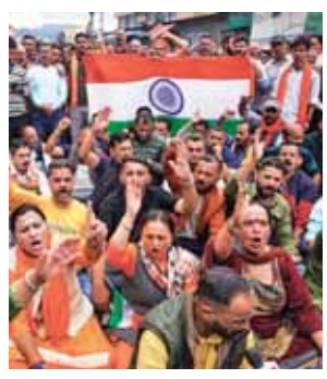
Members of Hindu organisations stage protest over illegal construction in a mosque, at Sanjauli, Shimla

while they were attempting to infiltrate inside the Indian territory in the Laam sector of Nowshera in the frontier district of Rajouri on Monday. For the past several days, different parts of Jammu and Kashmir have been witnessing an 'unprecedented' response to the high-voltage campaigning by the candidates representing various political parties. The atmosphere in Kashmir valley is electrifying as many candidates are canvassing as late as midnight in their native villages and mohallas in the urban centers amid tight security arrangements. In Jammu, unconfirmed reports indicated the BSF soldier was targeted by a sniper from across the International border. Senior BSF officials of the Jammu frontier rushed to the forward area to take stock of the ground situation.