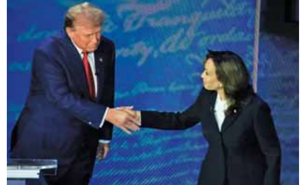
Republican presidential nominee former President Donald Trump shakes hands with Democratic presidential nominee Vice President Kamala Harris during an ABC News presidential debate at the National Constitution Center in Philadelphia

Kamala Harris pressed a forceful case against Donald Trump on Tuesday in their first and perhaps only debate before the presidential election, repeatedly goading him in an event that showcased their starkly different visions for the country on abortion, immigration and American democracy. The Democratic vice president provoked Trump with reminders about the 2020 election loss that he still denies, delivered derisive asides at his false claims and sought to underscore the Republican former president's role in the Supreme Court's overturning of a national right to abortion two years ago. Trump tore into Harris as too liberal and a continuation of Biden's unpopular administration, as he launched into the sort of free-wheeling personal attacks and digressions from which his advisers and supporters have tried to steer him away. In one moment, Harris turned to Trump and said that as vice president, she had