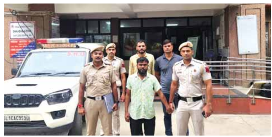
A 30-year-old man was arrested after four men allegedly opened fire outside a night club in Delhi's Shahdara