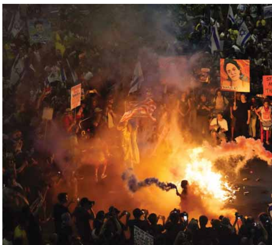
People protest against Prime Minister Benjamin Netanyahu's government and call for the release of hostages held in the Gaza Strip by the Hamas militant group, in Tel Aviv, Israel, Saturday

Three Israelis were shot and killed Sunday at the border crossing between the West Bank and Jordan, Israeli officials said, in what appeared to be an attack linked to the 11-month-old war in Gaza. The military said the gunman approached the Allenby Bridge Crossing from the Jordanian side in a truck and opened fire at Israeli security forces, who killed the assailant in a shootout. It said the three people killed were Israeli civilians. Israel's Magen David Adom rescue service said they were all men in their 50s. Jordan is investigating the shooting, its state-run Petra News Agency reported. The Western-allied Arab country made peace with Israel in 1994, but is deeply critical of its policies toward the Palestinians. Jordan has a large Palestinian population and has seen mass protests against Israel over the war in Gaza. The Allenby crossing over the Jordan River, also known as the King Hussein Bridge, is mainly used by Palestinians and international tourists, as well as for cargo shipments. The crossing has seen very few security incidents over the years, but in