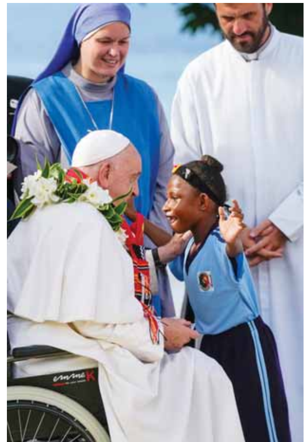
Pope Francis is hugged by a blind pupil of the Holy Trinity Humanistic School in Baro, near Vanimo, Papua New Guinea, on Sunday

It was a reference to the tribal violence over land and other disputes that have long characterised the country's culture