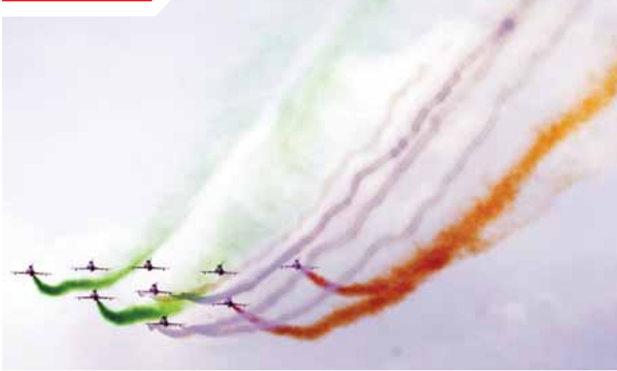
Indian Air Force aerobatics team Surya Kiran performs at exercise 'Tarang Shakti,' in Jodhpur