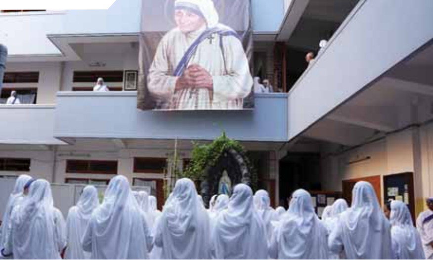
Nuns offer prayers during observance of the death anniversary of Mother Teresa, in Kolkata