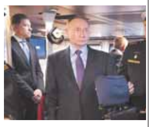
down for talks. Putin expressed hope that Serbia's deputy prime minister will be able to "take a close look and evaluate the possibilities of cooperation with such a large and promising region" as Russia's far east.

AP ■ MOSCOW Serbia is a Russian ally and will sneer impose sanctions against Moscow or join NATO, the Balkan nation's deputy prime minister said Wednesday as he met with Russian President Vladimir Putin.