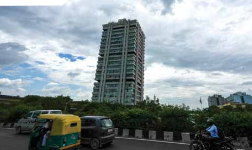
Clouds hover over the Delhi as vehicles pass by the Vikas Minar, in New Delhi