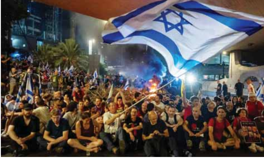
A labour court ruled that the strike must end by 2:30 pm local time, accepting a petition from the government saying it was politically motivated. The head of Israel's largest trade union, the Histadrut, said it would abide by the court decision and instructed members to return to work. Arnon Bar-David had

Hundreds of thousands of Israelis poured into the streets late Sunday in grief and anger after six hostages were found dead in Gaza. The families and much of the public blamed Prime Minister Benjamin Netanyahu, saying they could have been returned alive in a deal with Hamas to end the nearly 11-month-old war. But others support Netanyahu's strategy of maintaining military pressure on Hamas, whose October 7 attack into Israel triggered the war. They say it will force the militants to give in to Israeli demands, potentially facilitate rescue operations and ultimately annihilate the group.