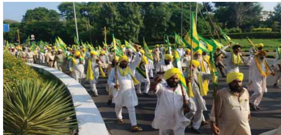
Farmers marching from Sector 34 to Matka Chowk in Chandigarh to demand urgent agricultural reforms from the Punjab Government on Monday.