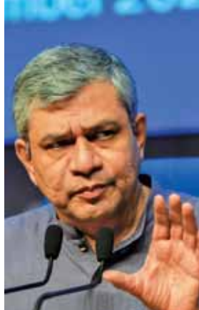
Union Minister Ashwini Vaishnaw briefs the media over cabinet decisions, in New Delhi, Monday

In an effort to improve the lives of farmers and increasing their income, the Union Cabinet chaired by Prime Minister Narendra Modi on Monday approved around ₹13,966 crore outlay for seven big-ticket programmes related to the farming sector, including a ₹2,817-crore digital agriculture mission and a ₹3,979-crore scheme for crop science. These programme will focus on harnessing public-funded digital infrastructure to research focussed on emerging challenges in the farm sector. The emphasis of these programmes would be on research & education, climate resilience, natural resource management and digitisation in the agriculture sector along with emphasis on growth of horticulture and livestock sectors. Addressing a press conference after the Union Cabinet meeting, Union Minister Ashwini Vaishnaw announced that the Union Cabinet, chaired by Prime Minister Narendra Modi, approved seven schemes to improve farmers' lives and increase their incomes at a total outlay of ₹13,966 crore. The Cabinet has approved crop science for food and nutritional security programmes with a total outlay ₹3,979 crore. In this programme, six pillars have been included in the programme with a