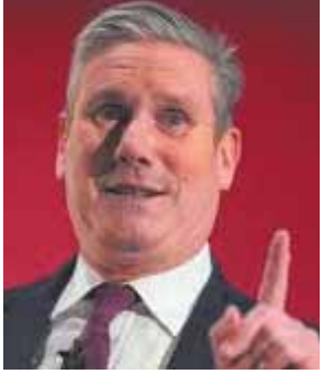
"Frankly, things will get worse before they get better," Starmer told voters in a televised speech last week. Starmer is seeking to hammer home the message that the right-leaning Conservative Party, booted out by voters in the July 4 election, presided over "14 years of rot" that's left Britain weakened economically, structurally and even morally. During the election campaign, Starmer vowed to get the country's sluggish economy growing