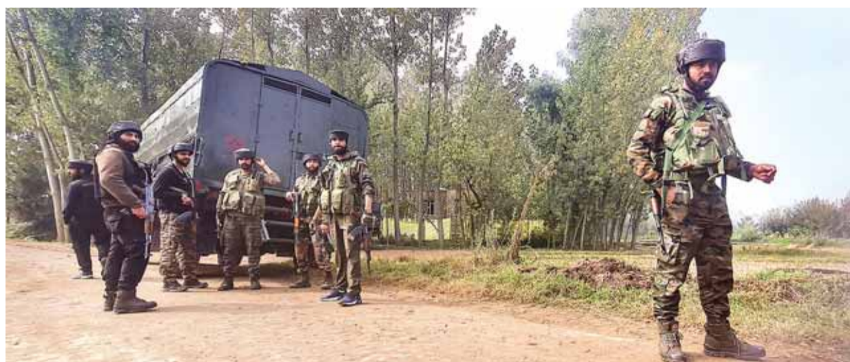
Security personnel stand guard after an encounter broke out between terrorists and security forces during cordon and search operation at Adigam village, in Kulgam district, Saturday