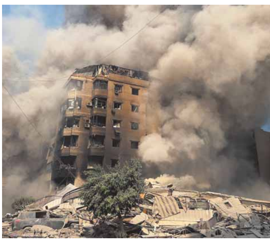
Smoke rises as a building collapses in Beirut's southern suburbs on Saturday.