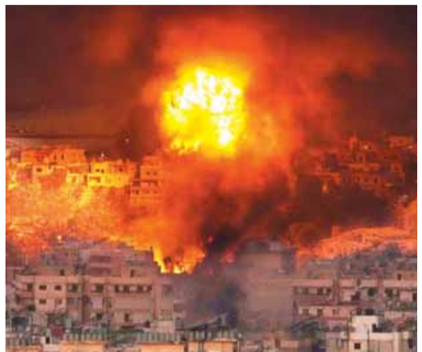
Flames rise after an Israeli airstrike in the southern suburbs of Beirut, Lebanon, Saturday