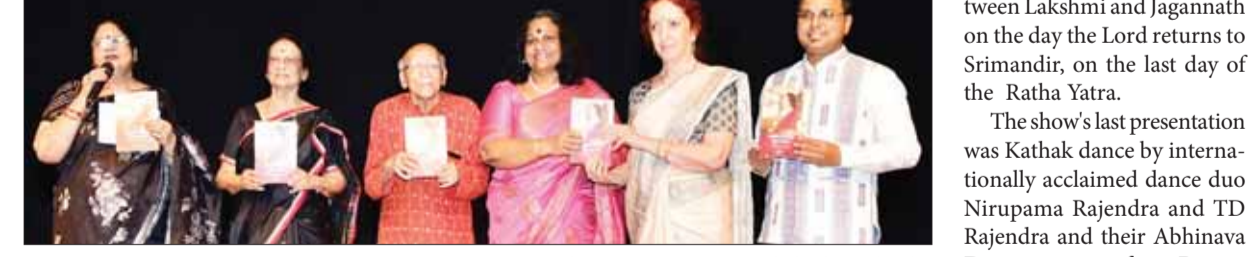
Performers on stage during Sangam Fest.