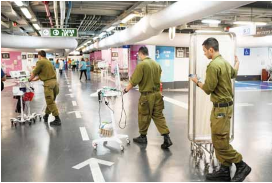
Hospital staff and soldiers move patients and equipment to the underground ward at Rambam medical center as fighting escalates between Israel and the Lebanese militant group Hezbollah. In Haifa, Israel, on Sunday.