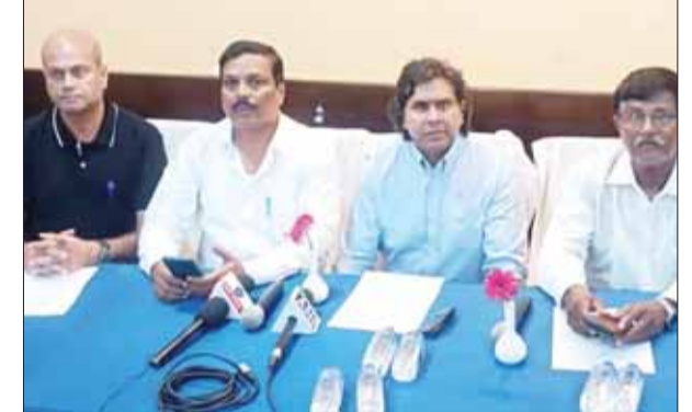
Forum members at a meeting.