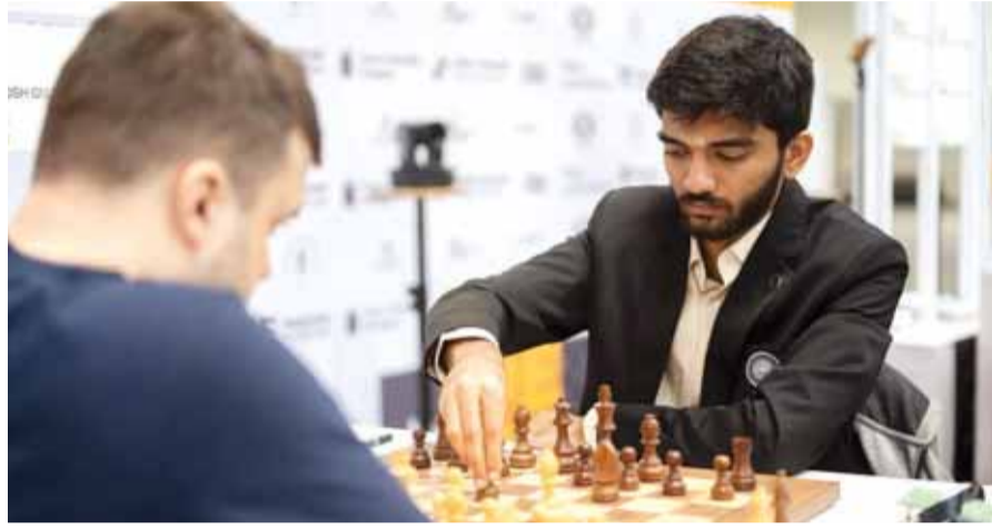
Gukesh D of India, during the final round of the 45th Chess Olympiad in Budapest, Hungary, Sunday