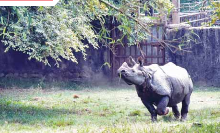
A one-horn Rhino at the Assam State Zoo on the World Rhino Day, in Guwahati