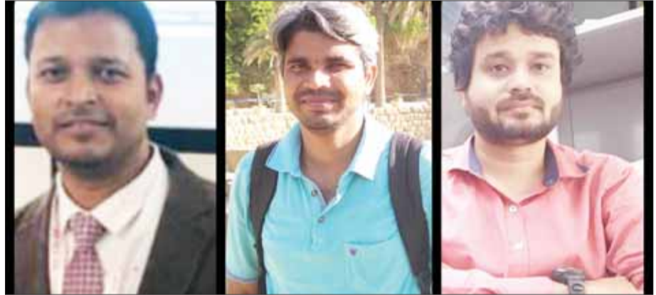
Three scientists being honored.

PNS ■ BALESWAR The Stanford/Elsevier Top 2% Scientist Rankings for 2024 have been released, showcasing the world's most impactful researchers across various fields.