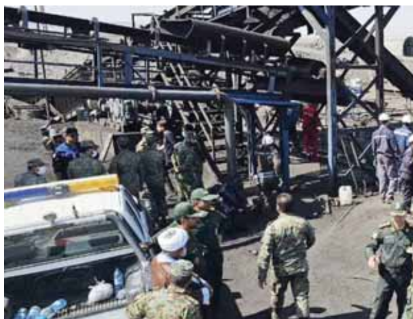
In this photo released by Iranian Red Crescent Society, miners and police officers are seen at the site of a coal mine where methane leak sparked an explosion on Saturday, in Tabas on Sunday. AP/PTI

An explosion in a coal mine in eastern Iran killed at least 34 workers and injured 17 others, officials said Sunday, marking one of the worst mining disasters in the country's history as others remained missing hours after the blast. The blast struck a coal mine in Tabas, about 540 km (335 miles) southeast of the capital, Tehran, on Saturday night. By Sunday, weeping miners stood alongside mine cars that brought up the bodies of their colleagues, all covered in coal dust.