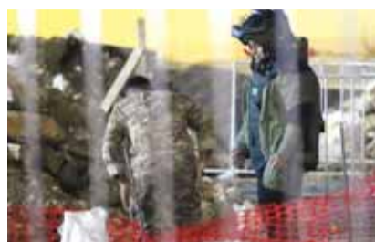
A Lebanese army bomb disposal specialist wearing a protective gear prepares, with his comrade, to detonate a walkie-talkie that was found at the parking of the American University Hospital, in Beirut, Lebanon

Addressing another rally earlier inside the fortified Sheri-Kashmir stadium in Srinagar, PM Modi praised the high voter turnout in the first phase stating that it represents a rejection of parties that 'sympathise with stone pelters and terrorists'.