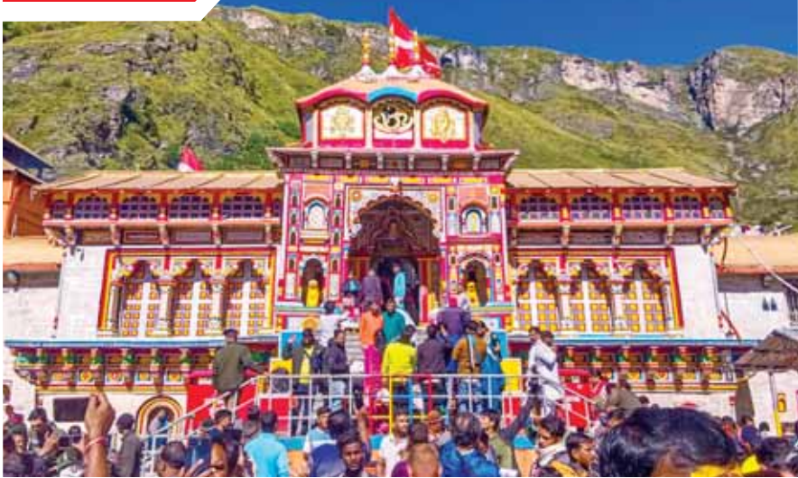
Pilgrims arrive at the Shri Badrinath Dham in Chamoli district