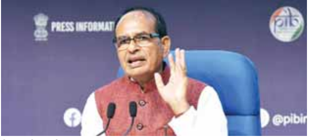
Shivraj Singh Chouhan at a press conference on 100 days achievements of the ministry at National Media Centre, in New Delhi on Thursday.

Agriculture Minister Shivraj Singh Chouhan on Thursday announced that the government will soon release the report of the committee on Minimum Support Price (MSP) for crops, which was established following the withdrawal of the three controversial farm laws.