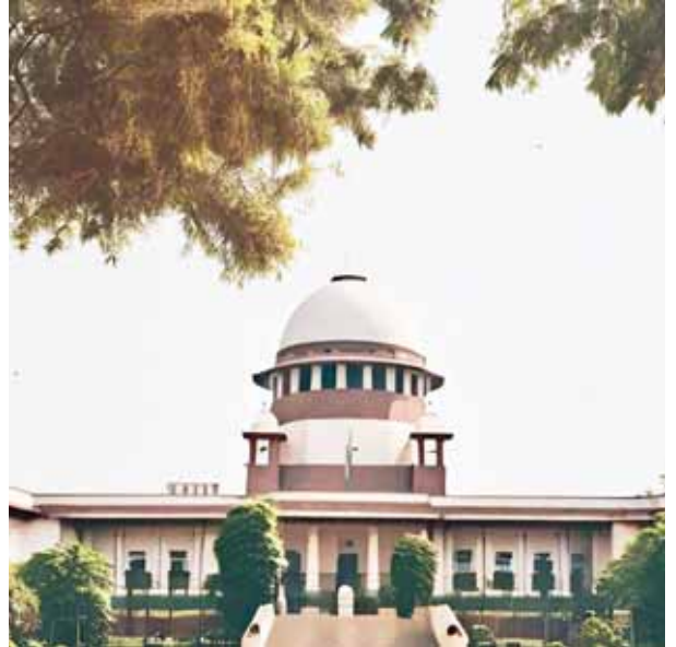
gone through the Curative documents. In our opinion, no case is made out within

In a jolt to telecom firms, the Supreme Court has dismissed a batch of pleas filed by companies, including Vodafone Idea and Bharti Airtel, seeking correction of alleged errors in the Adjusted Gross Revenue.