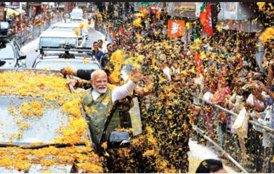
Prime Minister Narendra Modi during a roadshow for J and K Assembly elections, at Katra in Reasi district, Jammu and Kashmir, Thursday