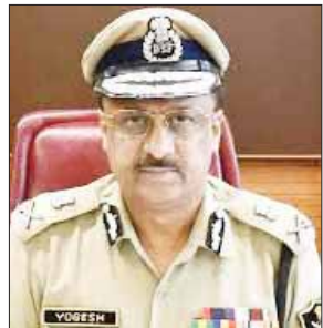
would complete the minimum tenure of two years as the DGP, the notification stated.