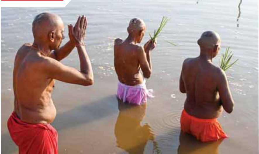
People perform 'pind daan' rituals at the bank of Falgu river on the first day of the Pitra Paksha, in Gaya