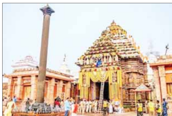
tech gadgets and other equipments to conduct a detail assessment and inspection inside the inner chamber of Ratna Bhandar.

PNS ■ PURI With mystery and a lot of apprehensions surrounding the presence of a 'secret tunnel' in the Jagannath Temple's Ratna Bhandar (treasure trove), a high-level team of the Archaeological Survey of India (ASI) on Wednesday started a preliminary inspection work for the purpose. A team of 26 experts from CSIR-NGRI under the supervision of Additional DG of ASI are involved in the inspection work. The inspection will be undertaken using high-