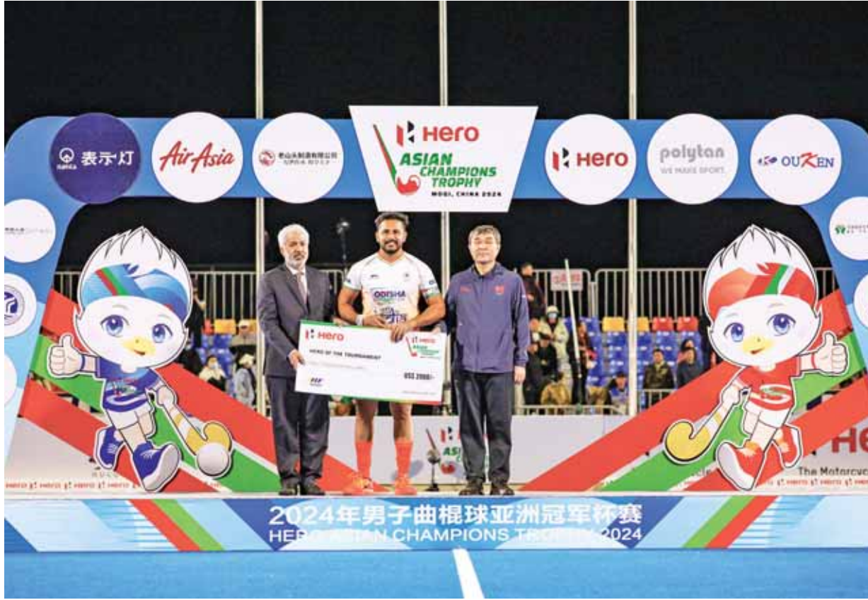
Chennai, the gold medal in the Hangzhou Asian Games and the bronze from the Paris 2024 Olympics have instilled