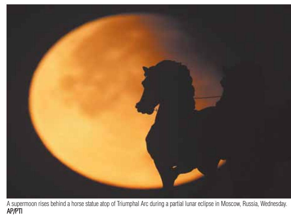
A supermoon rises behind a horse statue atop of Triumphal Arc during a partial lunar eclipse in Moscow, Russia, Wednesday.

port of call. "PNC revealed that the primary objective of the trip is to seek the strategies utilised by China, to achieve its current economic development, all while enhancing the bilateral ties between the two countries," the PSM News said.