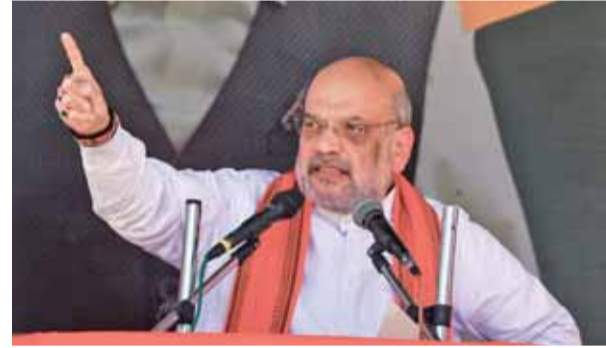
Union Home Minister Amit Shah speaks during a public meeting ahead of J&K Assembly elections, in Kishtwar district, Jammu & Kashmir, Monday

Launching a frontal attack on the pre-poll alliance partners, Congress and the National Conference on the last day of campaigning in Kishtwar, Union Home Minister Amit Shah on Monday appealed to the voters in the region to punish these parties by voting in favour of the BJP as they (Congress-National Conference) have always "nurtured and nourished" terrorism.