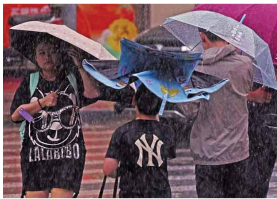
In this photo released by Xinhua News Agency, people brace for rain on a street as Typhoon Bebinca made landfall in Shanghai, China, Monday.

Long-time Jewish Chronicle columnist Jonathan Freedland resigned in protest on Sunday, saying "the latest scandal brings great disgrace on the paper" and that it has "departed from the traditions that built its reputation as the world's oldest Jewish newspaper". "Too often, the JC (Jewish Chronicle) reads like a partisan, ideological instrument, its judgements political rather than journalistic," Freedland wrote on the social media platform X.