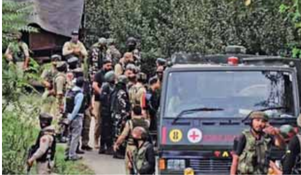
Security personnel during an encounter with militants at Chak Tapper Kreeni Pattan area, in Baramulla district, Jammu and Kashmir, Saturday

Ahead of the maiden visit of Prime Minister Narendra Modi to address an election rally in the land-locked Doda district on Saturday, two soldiers of the Indian army sacrificed their lives while two others received injuries during a counter-terrorism operation in the Chatroo area of Kishtwar on Friday. In another overnight operation launched in the kreeni area of North Kashmir's Baramulla district, three terrorists were gunned down by the joint team of security forces on Saturday. The security forces were able to neutralise a group of hiding terrorists after identifying their exact locations inside the building with the help of drone cameras. With this, the number of terrorists eliminated in the last three anti terrorist operations have gone up to seven. Chinar Corps of the Indian army in a post on X confirmed, "Three terrorists have been neutralised by the security forces in the ongoing Operation. Weapons and warlike stores have been recovered. The Chinarcops has dealt some crippling blows to the terror network in North Kashmir over the past few days with significant recoveries and elimination of terrorists, inspiring confidence and assurance for upcoming events scheduled in the region." Before the day ended, another