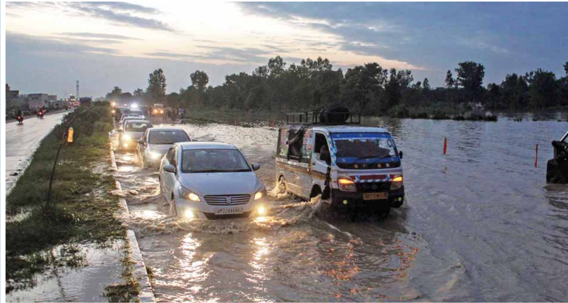
Vehicles pass through the waterlogged NH 24 after heavy rains, in Moradabad, Saturday