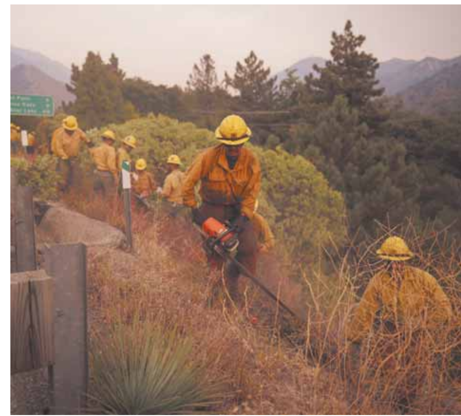
Firefighters work against the advancing Line Fire in Mentone, Calif. on Sunday.