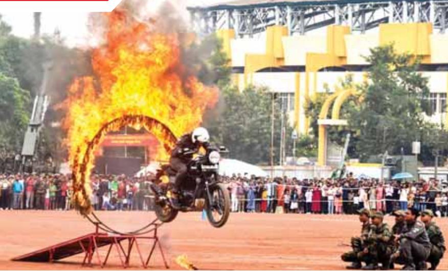
Army jawans perform stunts during the closing ceremony of 'Know Your Army' programme in Ranchi