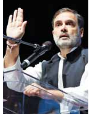
LoP in Lok Sabha and Congress MP Rahul Gandhi addresses the Indian Diaspora, at Dallas in Texas, USA.

"Everybody knows that Rahul Gandhi is an immature and part-time leader. But People have put a huge responsibility on his shoulders since he became the leader of opposition (in the Lok Sabha). But I feel sad to say that Rahul Gandhi is a black spot in Indian democracy. He does not even know what to talk about when he visits a foreign country," said Gaurav Bhatia, BJP's national spokesperson, at a Press conference at the BJP