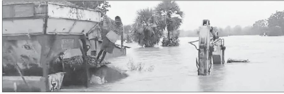
Koraput and Andhra were stranded on roadsides.

The district has been cut off from the rest of the world as communication to Koraput has been completely disrupted. The Piligada Bridge was swept away, due to which road combination to Andhra Pradesh and Telangana was disrupted. With bridges under water, hundreds of trucks and other vehicles on their way to