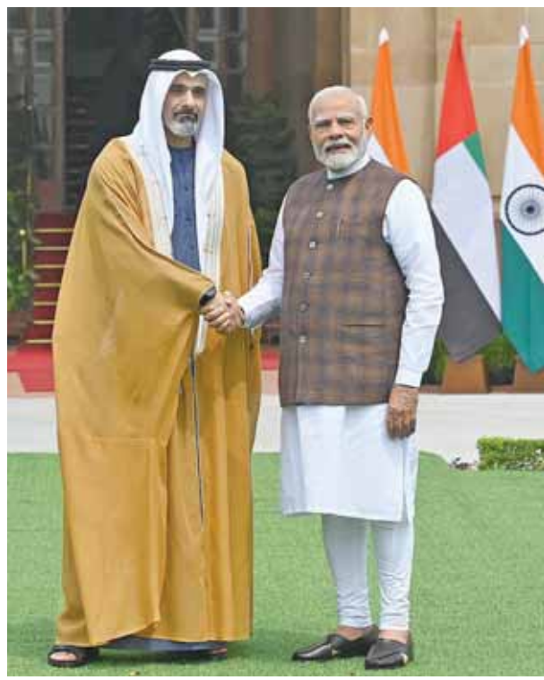
Prime Minister Narendra Modi meets Abu Dhabi's Crown Prince Sheikh Khalid bin Mohamed bin Zayed Al Nahyan at the Hyderabad House, in New Delhi, Monday.

After holding talks with Modi, the visiting leader paid tributes to Mahatma Gandhi at his memorial Rajghat. An Agreement for long-term LNG supply between Abu Dhabi National Oil Company (ADNOC) and Indian Oil Corporation Ltd and another between ADNOC and India Strategic Petroleum Reserve Ltd (ISPRL) are among the