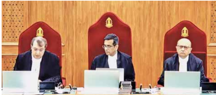
A bench comprising Chief Justice of India (CJI) D.Y. Chandrachud, Justice J.B. Pardiwala and Justice Manoj Misra during the second day of hearing on a suo moto case related to the alleged sexual assault and murder of a postgraduate trainee doctor in Kolkata, at the Supreme Court in New Delhi, Monday, September 9, 2024.

"We also direct that in the event the doctors return to duty on or before 5 pm (on Tuesday), no adverse disciplinary action should be taken against them. If there is continued abstention of work, there may be a likelihood of