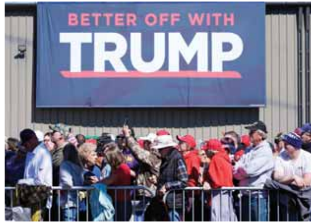
Supporters attend a campaign event for Republican presidential nominee former President Donald Trump at Central Wisconsin Airport, Saturday, in Mosinee.

"Please beware," he went on, "that this legal exposure extends to Lawyers, Political Operatives, Donors, Illegal Voters, & Corrupt Election Officials. Those involved in unscrupulous behaviour will be