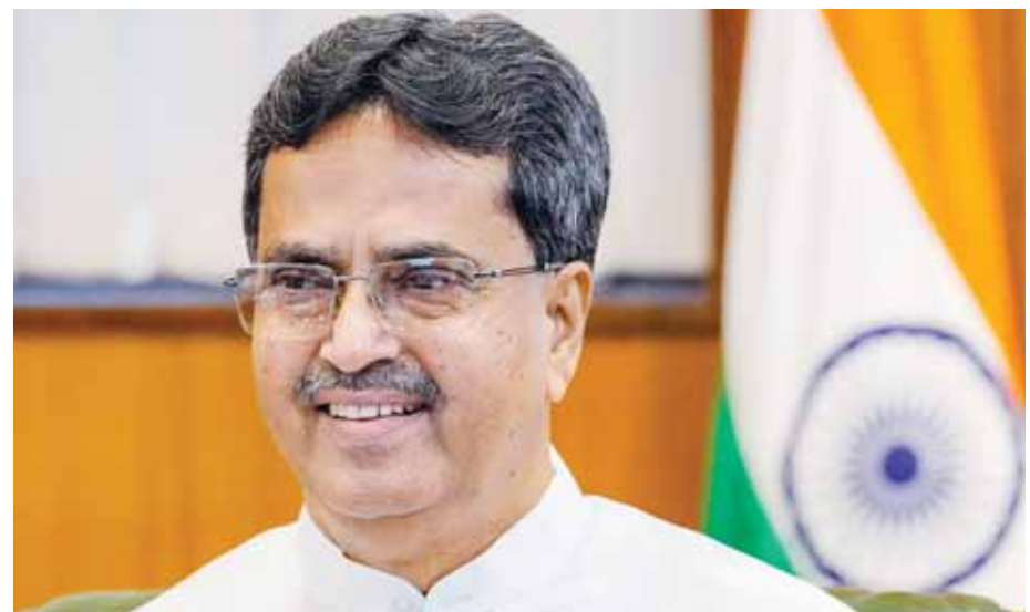
PTI ■ AGARTALA

In a bid to check fatal road accidents caused by drunken driving, Tripura Chief Minister Manik Saha on Sunday directed law enforcement agencies to prepare a comprehensive report on liquor shops operating within 100 metres of national highways following which his government would take steps to relocate the outlets. In December 2017, the Supreme Court banned the sale of liquor within 500 meters of the outer edge of national and state highways and the limit was reduced to