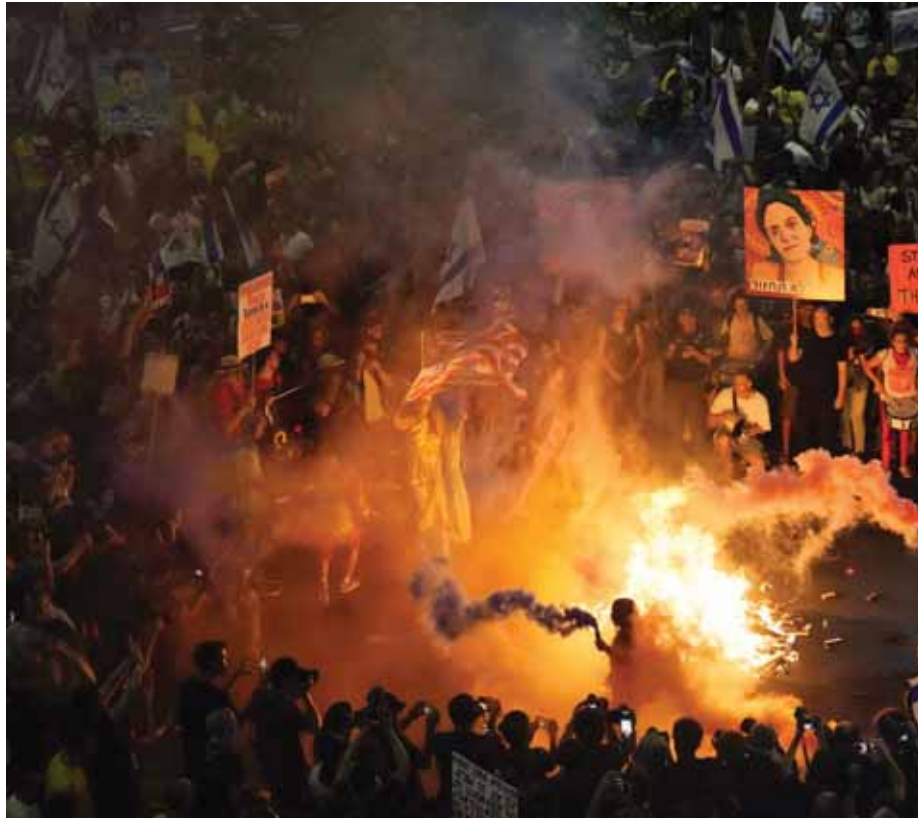
People protest against Prime Minister Benjamin Netanyahu's government and call for the release of hostages held in the Gaza Strip by the Hamas militant group, in Tel Aviv, Israel, Saturday

Three Israelis were shot and killed Sunday at the border crossing between the West Bank and Jordan, Israeli officials said, in what appeared to be an attack linked to the 11-month-old war in Gaza. The military said the gunman approached the Allenby Bridge Crossing from the Jordanian side in a truck and opened fire at Israeli security forces, who killed the assailant in a shootout. It said the three people killed were Israeli civilians. Israel's Magen David Adom rescue service said they were all men in their 50s. Jordan is investigating the shooting, its state-run Petra News Agency reported. The Western-allied Arab country made peace with Israel in 1994, but is deeply critical of its policies toward the Palestinians. Jordan has a large Palestinian population and has seen mass protests against Israel over the war in Gaza. The Allenby crossing over the Jordan River, also known as the King Hussein Bridge, is mainly used by Palestinians and international tourists, as well as for cargo shipments. The crossing has seen very few security incidents over the years, but in