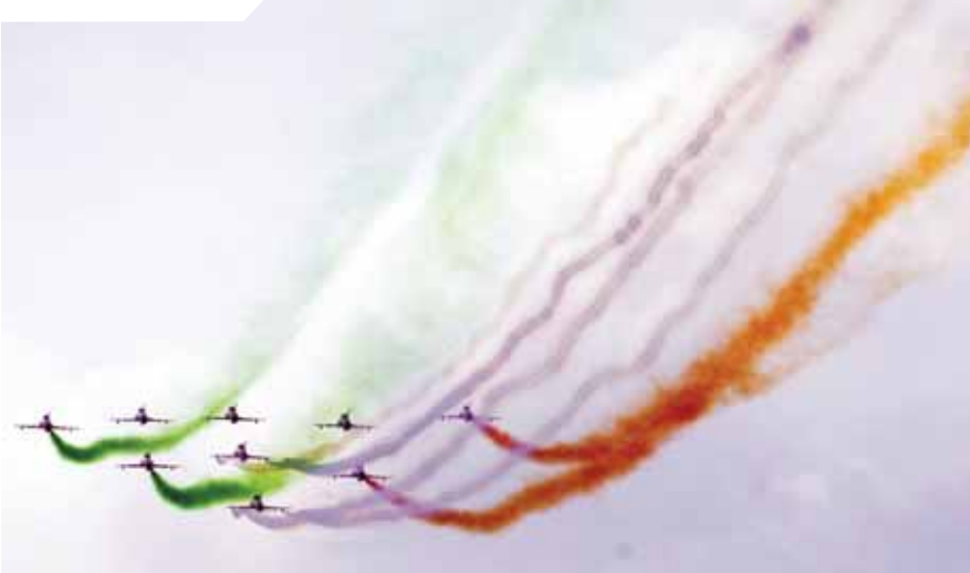
Indian Air Force aerobatics team Surya Kiran performs at exercise 'Tarang Shakti,' in Jodhpur