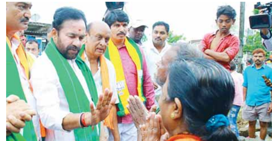
PTI ■ HYDERABAD

Telangana BJP president and Union Coal Minister G Kishan Reddy on Sunday visited flood-hit areas of Khammam district of the state and assured the people that the Narendra Modi government would fully support those affected in every possible way. He said the Centre has the Telangana government to first use the Rs 1,345 crore available in the State Disaster Response Fund (SDRF) to help the flood-hit people. The amount is available with the state as an advance from the Government of India, he said. "Soon after the havoc caused by heavy rains and flood, Prime Minister Narendra Modi spoke to Telangana Chief Minister A Revanth Reddy. PM Modi asked him (Revanth Reddy) to utilise the advance of Rs 1,345 crore in the SDRF. There should be no politics over flood relief," Kishan Reddy said, after visiting the Munneru flood victims in Khammam district on Sunday. As many as 29 people lost their lives in the recent heavy rains and flooding in Telangana. The state government has urged the Centre to declare the recent spell of heavy rains and flood in the state as a national calamity and to release immediate assistance of Rs 2,000