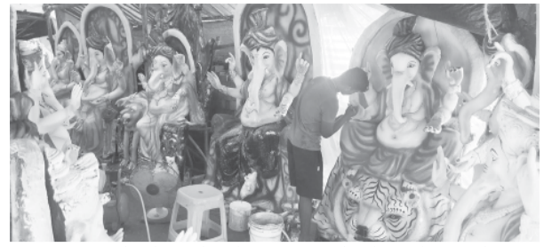
An artisan of Athagarh is busy giving final touches to the images of the Lord on Thursday ahead of Ganesh Puja on Saturday.