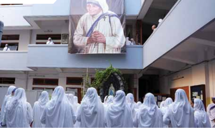
Nuns offer prayers during observance of the death anniversary of Mother Teresa, in Kolkata