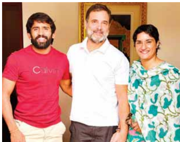
Leader of the Opposition Rahul Gandhi with wrestlers Vinesh Phogat and Bajrang Punia in New Delhi