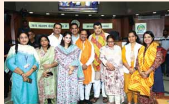
The Pioneer photo