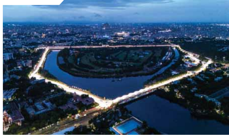
An aerial view of the illuminated Chennai Street Circuit during the Formula 4 Street Car Race, in Chennai