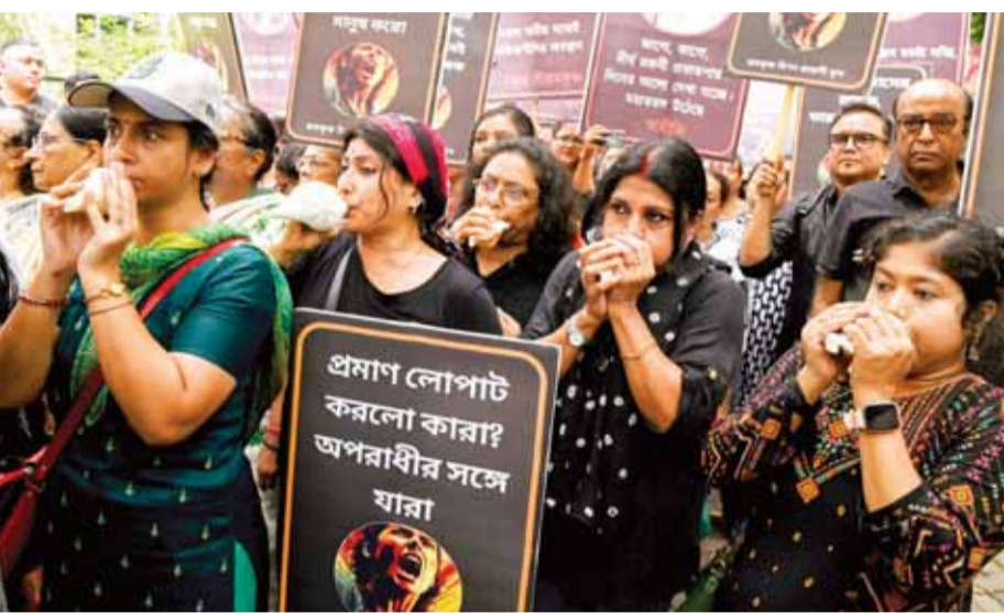
Ramkrishna Mission alumni wearing black dresses blow conches during a protest rally demanding justice for the victim of R G Kar Medical College and Hospital incident, in Kolkata, on Sunday