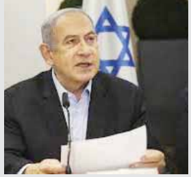
doesn't want a deal," he said. Critics in Israel have accused Netanyahu of dragging his feet in cease-fire talks — a charge he denies.

Jerusalem: Israeli Prime Minister Benjamin Netanyahu has expressed sorrow over the deaths of six hostages, saying the killings prove that Hamas does not want a cease-fire deal. Netanyahu said Sunday that he was heartbroken to hear the news of the hostages' deaths. He accused Hamas of killing them in "cold blood" and said Israel would hold the group accountable. He also accused the group of scuttling ongoing cease-fire efforts. "Whoever murders hostages