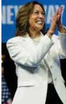
be clear: the former president disrespected sacred ground, all for the sake of a political stunt," Harris said, calling Arlington a "solemn place where we come together to honour American heroes ...

US Vice President Kamala Harris said former President Donald Trump "disrespected sacred ground" in his recent appearance at Arlington National Cemetery, where the Republican nominee took and distributed images despite a federal prohibition on campaign activity on the grounds. Harris, in a statement posted Saturday on the social media platform X, cited reports that Trump's campaign aides created an altercation with a cemetery staffer and proceeded to take photographs and film the former president, including at the graves of Afghanistan war veterans, after being warned about rules at the site. "Let me