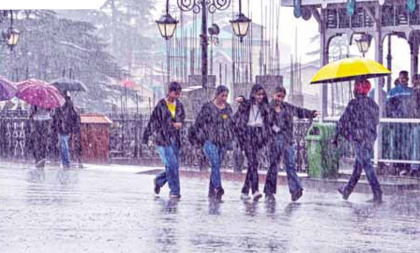
People walk down a road during rain, in Shimla.