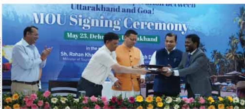
>> CM Pushkar Singh Dhama, CM, Uttarakhand, interacting with Goa government officials. MoU was signed recently with with an aim to enhance the overall tourism in both states

Following PM Modi's vision, and under the leadership of CM Pushkar Singh Dhama, Uttarakhand has embarked on creating better experiences for tourists