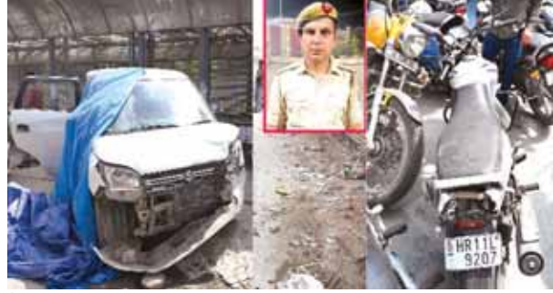
A damaged car that was involved in an accident, outside Nangloi police station, in New Delhi, Sunday

A 30-year-old Delhi Police constable was crushed to death in a road rage incident late Saturday night in the Nangloi area after asking a driver to move his car in the national capital. The constable was reportedly dragged for 10 metres before being hit by another vehicle. The incident occurred when the constable was monitoring the area due to a rise in burglaries, dressed in civilian clothes.