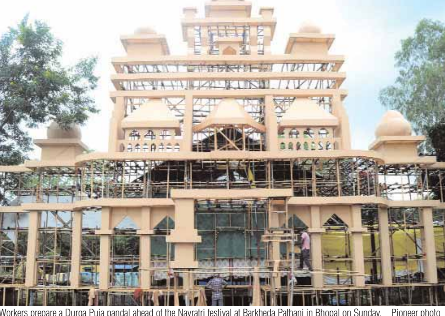
Workers prepare a Durga Puja pandal ahead of the Navratri festival at Barkheda Pathani in Bhopal on Sunday.