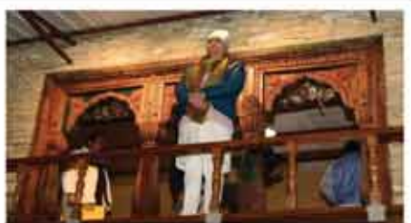
>> CM Pushkar Singh Dhama at a homestay esque and quaint locations, where finding quality accommodation is still a challenge. For locals, who have set up accommodation units at these locations, it is difficult to reach out to their potential guests through online medium. The uttarastays.com portal is set to bridge this gap and provide exposure to all homestays of the state.

The Himalayan hinterland is dotted with pictur-