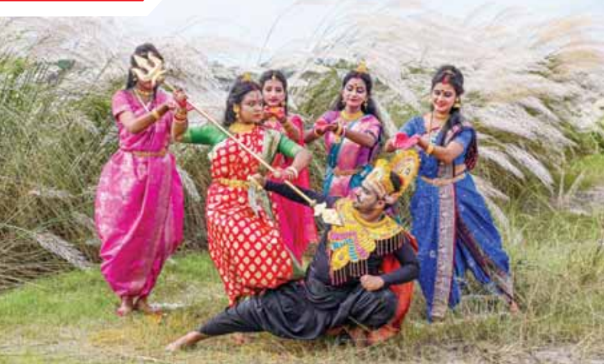
Artistes perform 'Mahishasur Mardini' act ahead of Durga Puja festival, in Nadia district