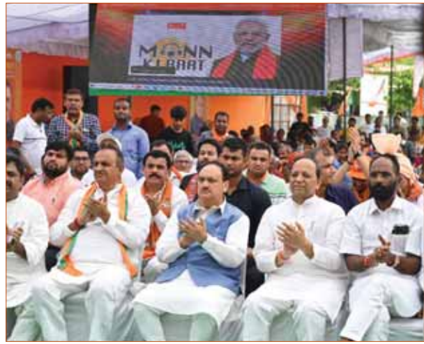
Union Minister and BJP National President JP Nadda, and others listen to Prime Minister Narendra Modi's 'Mann Ki Baat' radio programme, in New Delhi, Sunday

amend are the Government of National Capital Territory of Delhi Act-1991, the Government of Union Territories Act-1963 and the Jammu and Kashmir Reorganisation Act-2019. The proposed bill will be an ordinary legislation not requiring a change in the Constitution and will also not need ratification by the states. The high-level committee had proposed amendments to three Articles, insertion of 12 new sub-clauses in the existing articles and tweaking three laws related to Union Territories having legislative assemblies. The total number of amendments and new insertions stands at 18. In its report submitted to the government in March, just before the general election was announced, the panel recommended implementing "one nation, one election" in two phases. It suggested simultaneous polls for the Lok Sabha and state assemblies in the first phase and elections for local bodies like panchayats and municipal bodies within 100 days of the general election in the second phase. It also recommended a common electoral roll, which would need coordination between the Election Commission and State Election Commissions.