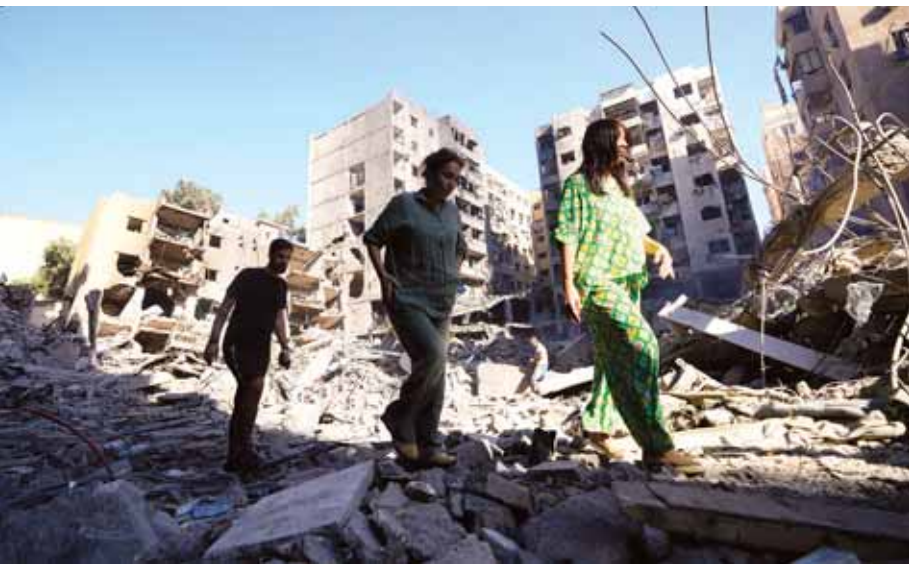
People check the site of the assassination of Hezbollah leader Hassan Nasrallah in Beirut's southern suburbs, Sunday