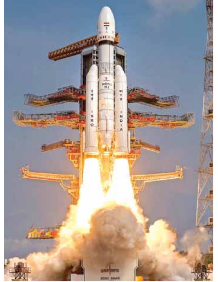
Chandrayaan-3 landed on possibly oldest craters of Moon, say researchers File Photo