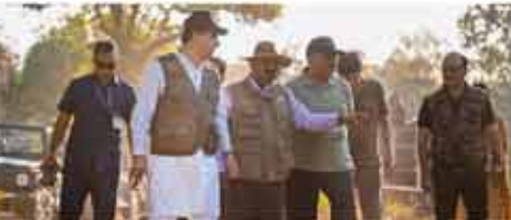
>> CM on his visit to Corbett National Park