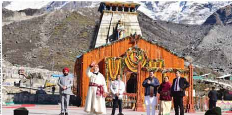
>> PM Narendra Modi along with CM Pushkar Singh Dhama during his visit to Kedarnath Dham

Inspired by Prime Minister Narendra Modi's vision, Chief Minister Pushkar Singh Dhama is pushing ahead Uttarakhand government's efforts to transform Kedarnath into a premier spiritual destination