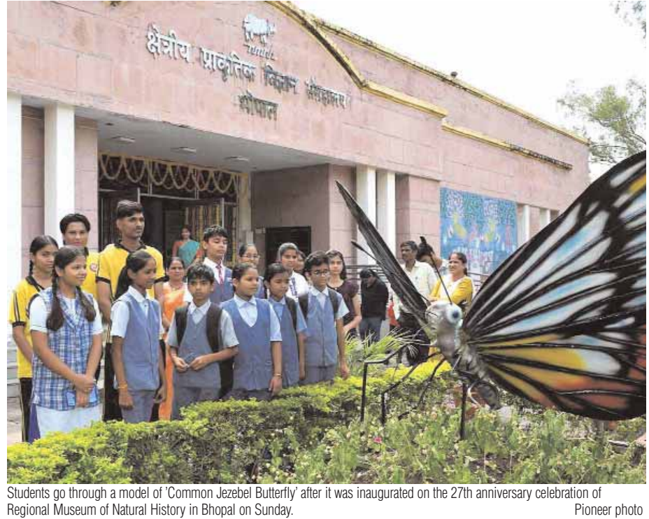
Students go through a model of 'Common Jezebel Butterfly' after it was inaugurated on the 27th anniversary celebration of Regional Museum of Natural History in Bhopal on Sunday.