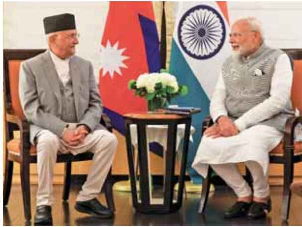
Prime Minister Narendra Modi with Nepal's Prime Minister KP Sharma Oli during a meeting at New York

"Deepening the warm and close friendship. PM @narendramodi met PM @kphsharmaoli of Nepal, on the sidelines of the UNGA today," the official account of the Ministry of External Affairs said in a post on X. "The two leaders discussed matters of mutual interest to strengthen cooperation in all areas of age-old, multi-faceted and expanding partnership," it added. Oli is in the US on his maiden foreign visit to attend the 79th Session of the UNGA, breaking the tradition of visiting a neighbouring country first.