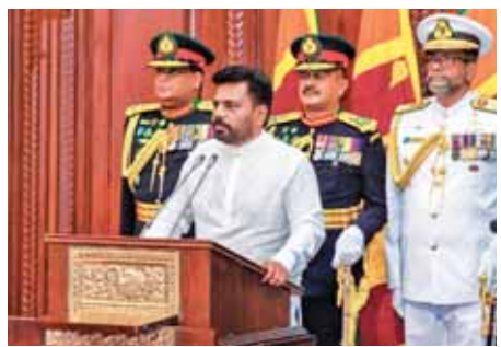
Anura Kumara Disسانayake takes oath as Sri Lanka's new president during a ceremony, in Colombo, Monday

To ensure hassle-free voting the Election Commission of India (ECI) has established 3502 polling stations with 100% webcasting across 26 Assembly constituencies. These include 1056 Urban Polling stations and 2446 Rural Polling stations. The ECI authorities are also hoping to see higher voter turnout in the second phase. In the first phase, 61.38 per cent of polling was recorded across 24 Assembly segments.