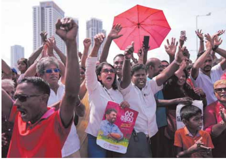
Supporters of Marxist lawmaker Anura Kumara Dissanayake cheer outside the president's office as he arrives to be sworn in as Sri Lanka's 10th president in Colombo, Sri Lanka, Monday.

Marxist leader Anura Kumara Dissanayake on Monday took oath as Sri Lanka's new president and said he will usher in a "Renaissance" for his country. Dissanayake, 56, was sworn in as Sri Lanka's ninth president by Chief Justice Jayantha Jayasuriya at the Presidential Secretariat. In his inaugural address to the nation, Dissanayake thanked his predecessor Ranil Wickremesinghe for respecting the people's mandate and facilitating a peaceful transfer of power. "I assure you that I will do my best to preserve democracy and work towards restoring the honour of politicians as people have misgivings about their conduct," Dissanayake said in an address after taking the oath. Dissanayake stressed Sri Lanka cannot remain in isolation and needed international cooperation. He said he is not a magician, but his objective is to be part of a collective responsibility to elevate the economic crisis-stricken country. "I'm not a magician. I'm an ordinary citizen born in this country. I have abilities and shortcomings. I have things I know and don't know. My first task is to make use of people's talents and know-how and make better decisions to lead this country," he said. "I