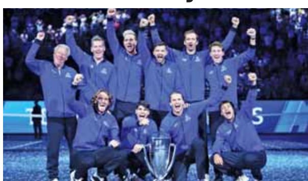
downed Australian Open finalist Daniil Medvedev 6-7 (6), 7-5, 10-7 to move the World team into pole position. Tiafoe, who reached the U.S. Open semifinals, could have sealed it for them but he lost to French Open finalist Alexander Zverev 6-7 (5), 7-5, 10-5, setting up the decider between Alcaraz and Fritz. The Laver Cup is for-

Four-time Grand Slam champion Carlos Alcaraz overcame Taylor Fritz 6-7 (6), 7-5 as Team Europe rallied to beat Team World 13-11 and win the Laver Cup. Alcaraz broke the U.S. Open runner-up Fritz in the 11th game and then closed out victory on serve, sparking celebrations as the Europe team rejoiced with captain Bjorn Borg in Berlin. Team World was favorite to win the Laver Cup for a third straight time after leading 8-4 on points heading into the last of the three days. Europe began the comeback Sunday when Alcaraz and Casper Ruud won the doubles 6-2, 7-6 (6) against American pair Ben Shelton and Frances Tiafoe. But Shelton then