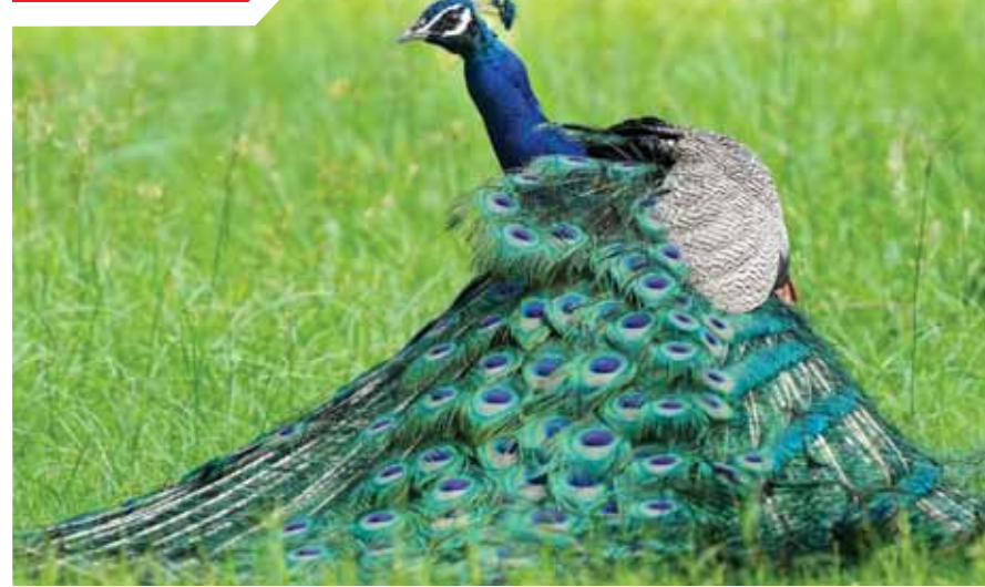
A peacock spreads its plume at the National Zoological Park, in New Delhi