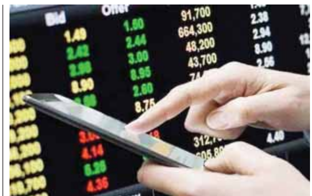
PTI ■ NEW DELHI