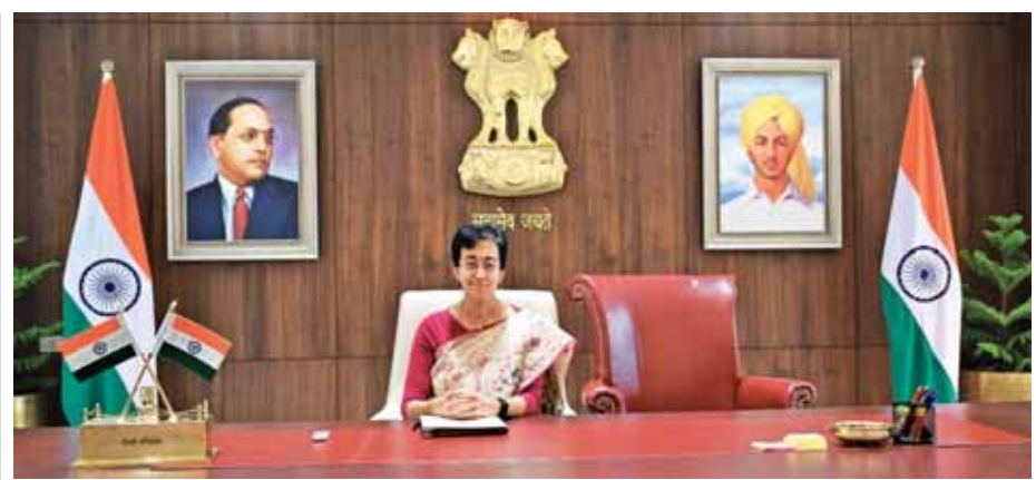
Atishi takes charge at her office as Chief Minister of Delhi, Monday

Admittedly, two videos involving boys were downloaded and were available on the petitioner's mobile phone, and those were neither published nor transmitted to others and were within the petitioner's private domain, said the High Court by quashing the criminal case. The High Court had advised the petitioner to attend counselling if he was still afflicted with the addiction of watching pornography.