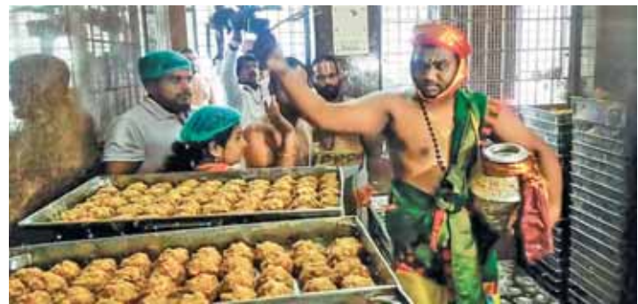
A priest performs the purification ritual at Tirupati Temple, Monday