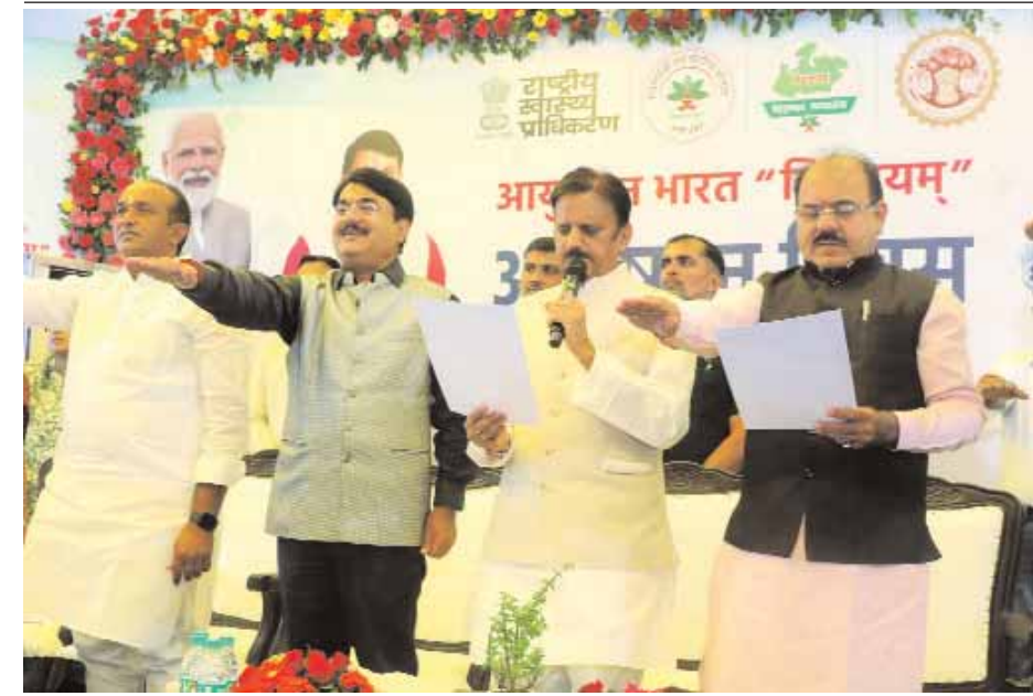
Deputy Chief Minister Rajendra Shukla administers oath during a programme on the 6th anniversary of Ayushman Bharat scheme marking as Ayushman Diwas, at Government KN Katju hospital on Monday.