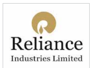
PTI ■ NEW DELHI