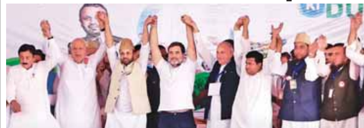
Leader of Opposition in Lok Sabha and Congress leader Rahul Gandhi with J and K National Conference President Farooq Abdullah during an election meeting at Surankote, in Poonch district, Monday