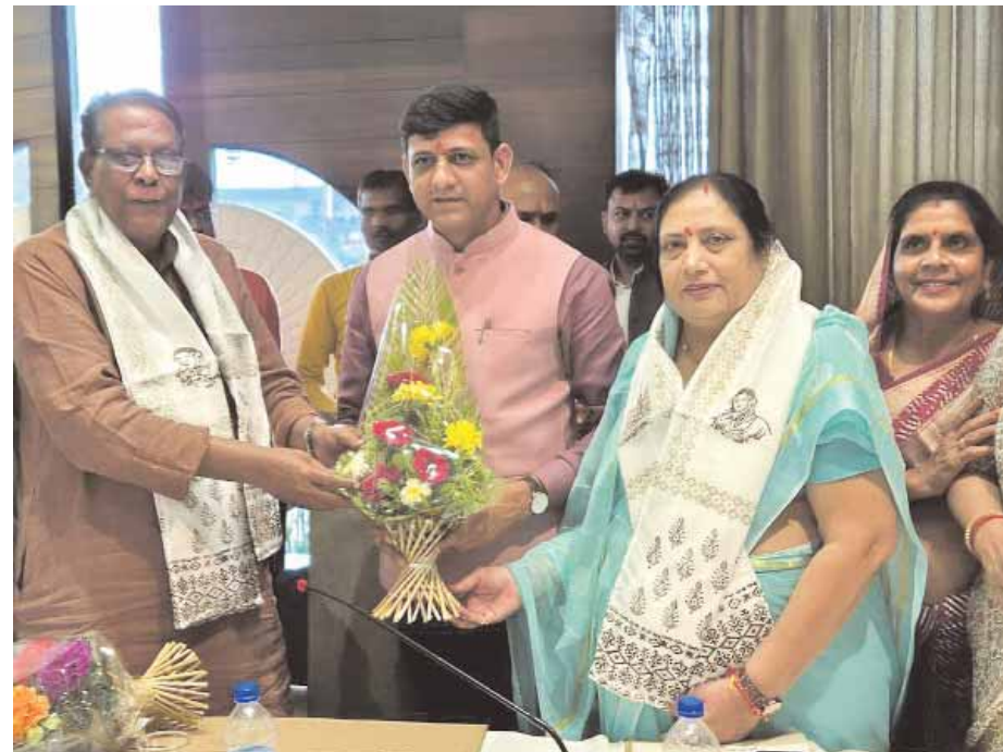
Mayor of Indore Pushyamitra Bhargava being greeted after he was elected president of Madhya Pradesh Mayor Council during a meeting of All India Council of Mayors in Dewas, Madhya Pradesh on Monday.

Explaining the working of an MP representative, they say that it is only an arrangement and not an official position, before adding that the weight this position carries depends largely on the individual's personality. While unofficially the Congress sought to draw a wedge in the BJP by feigning concern for Patel, party State media in-charge Mukesh Nayak said that the matter was internal to the BJP and added that it was certainly unusual. "It's like a postgraduate going back to take high school examinations," he said. Even if the appointment has presented Patel's detractors with a momentary victory, the BJP leader's chemistry with voters in the Harda district is sure to serve as a headache for the Congress in the months to come.