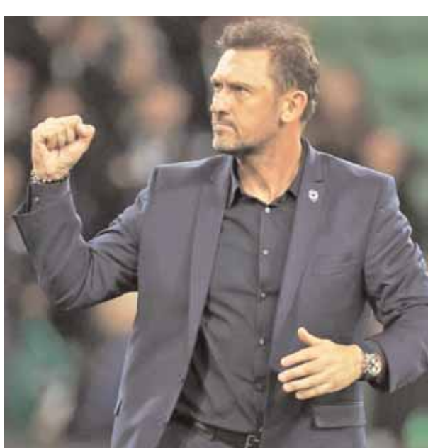
2014, and has also had successful stints with the Perth Glory and Melbourne Victory in Australia's A-League. Earlier in his career, Popovic had stints as an assistant at Crystal Palace and coached at clubs in Turkey and Greece.

Football Australia has appointed former Asian Champions League winning manager Tony Popovic as the new head coach of the Australian men's team until the end of the 2026 World Cup. Popovic, 51, replaces Graham Arnold, who stepped down last week after an indifferent start to the Socceroos' World Cup qualification in the Asia zone. "I am extremely honoured to be given this opportunity to lead the Socceroos as head coach," Popovic said in a statement on Monday. "It's a role that comes with great responsibility, and I'm deeply grateful for the opportunity. To be entrusted with guiding our national team is a privilege that I do not take lightly. Popovic is best known for guiding the Western Sydney Wanderers to the Asian Champions League title in