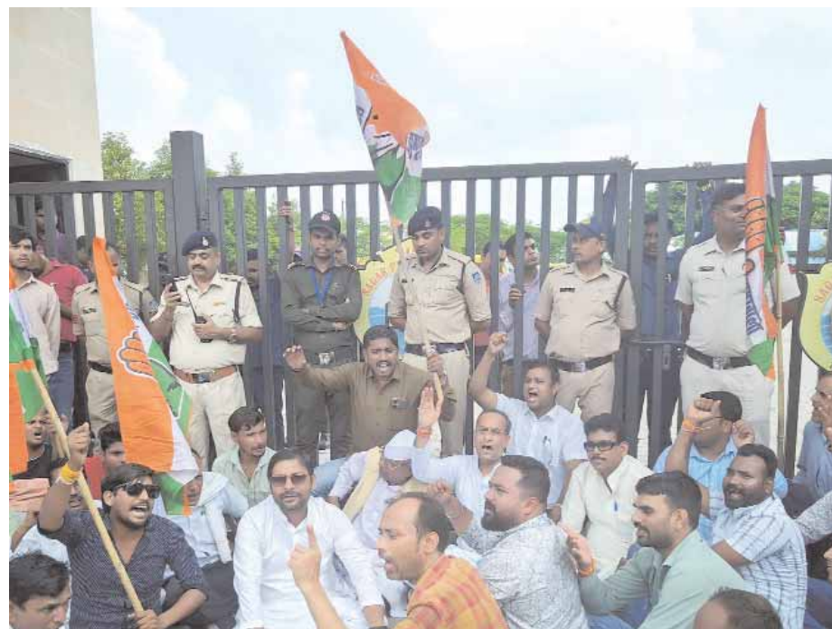
Congress party workers stage a protest against the alleged rape incident with a high school girl student by a teacher at Sagar Public School, Katara hills in Bhopal on Monday.

Chhindwara district. 8 districts (Sheopurkalan, Morena, Bhand, Shivpuri, Guna, Ashoknagar, Gwalior and Datia) come under the jurisdiction of Saharia Development Authority. Food grant amount of Rs 1500 is being given per month Food grant is also given by the state government to special backward tribal groups. To free these groups from malnutrition, the government is providing Rs 1500 per month in the bank accounts of the female head of Baiga, Bharia and Saharia families. In the current financial year, from April 1 to August 31, 2024, a total of more than Rs 180 crore of food grant amount has been given to 2 lakh 18 thousand 563 beneficiaries.