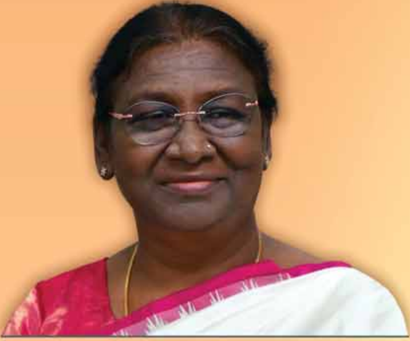
श्रीमती द्रौपदी मुर्मु, भारत की राष्ट्रपति

देश में लहराता स्वच्छता का परचम निरंतर बढ़ते प्रगति के कदम