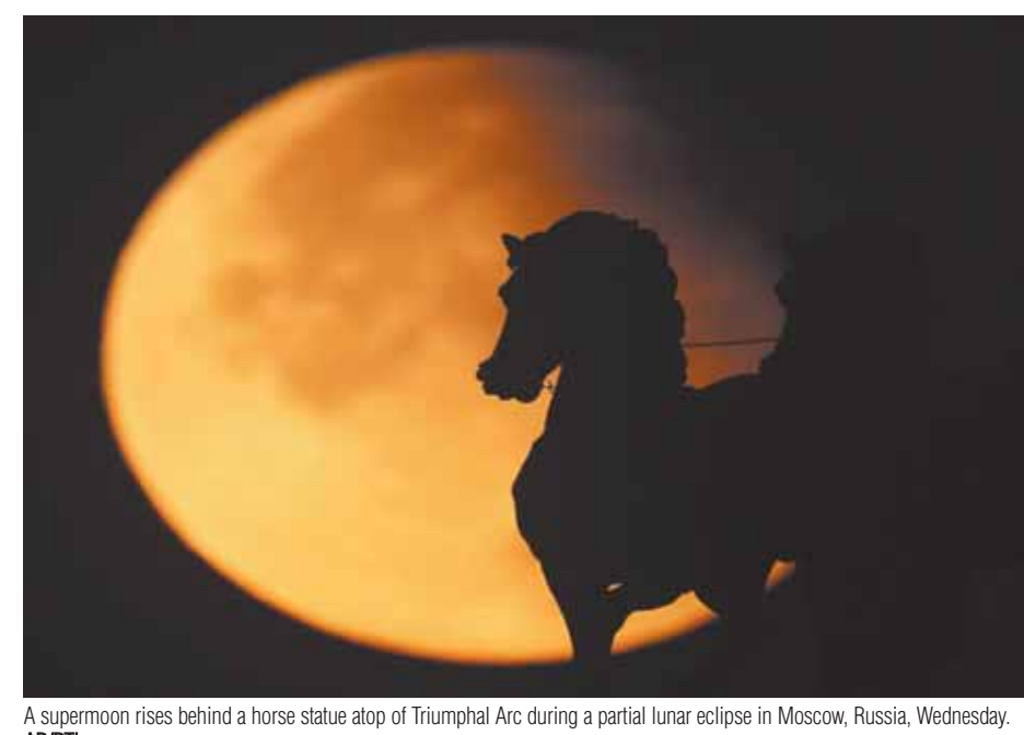
A supermoon rises behind a horse statue atop of Triumphal Arc during a partial lunar eclipse in Moscow, Russia, Wednesday

port of call. "PNC revealed that the primary objective of the trip is to seek the strategies utilised by China, to achieve its current economic development, all while enhancing the bilateral ties between the two countries," the PSM News said.