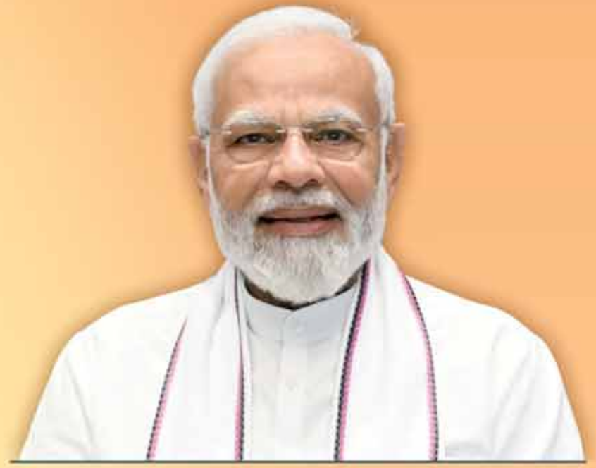
नरेन्द्र मोदी, प्रधानमंत्री