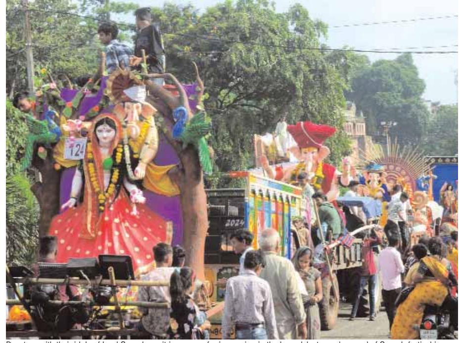
Devotees with their idols of Lord Ganesha wait in a queue for immersion in the lower lake to mark an end of Ganesh festival in Bhopal on Wednesday.