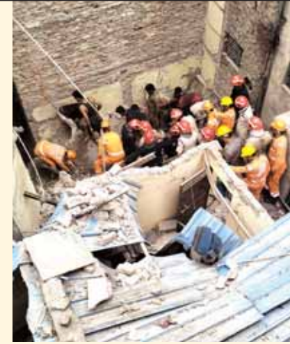
NDRF and Fire personnel conduct rescue operation as a house collapsed at Bapa Nagar (Karol Bagh) in New Delhi, on Wednesday