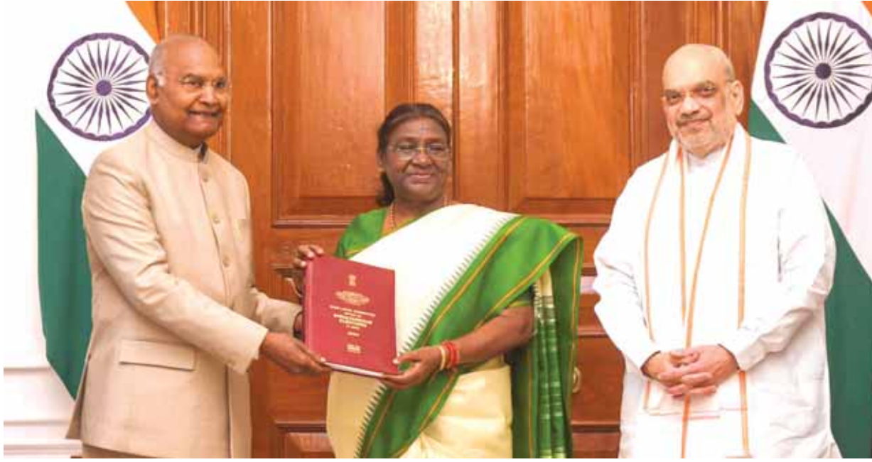
President Droupadi Murmu being presented a report on simultaneous elections in the country by former President Ram Nath Kovind who heads High-Level Committee (HLC) on 'One Nation, One Election', and Home Minister Amit Shah, at Rashtrapati Bhavan in New Delhi

The Centre has geared up to realise the dreams of having simultaneous polls as it went ahead in approving the high-level panel's recommendations on "one nation, one election" plan for holding for the Lok Sabha, State Assemblies and Local Bodies elections simultaneously in a phased manner after a countrywide consensus-building exercise. The recommendations could be tabled in the Winter Session of Parliament and sources indicate that the Government would implement it in its current tenure. While Prime Minister Narendra Modi said it was an important step towards making our democracy more vibrant and participative, Opposition parties shared a mixed response. The high-level committee approached 62 political parties, of which 47 responded -- 32 voicing support to holding simultaneous polls and 15 opposing it. Fifteen political parties did not submit a response. "I compliment ex-President Ram Nath Kovind for spearheading effort," Modi expressed through social media after Cabinet nod for simultaneous polls recommendation. Among the national parties, the Congress, Aam Aadmi Party (AAP), the Bahujan