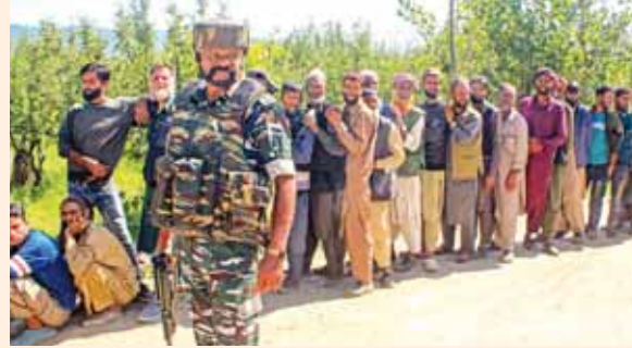
Shopian: Voters wait in a queue at a polling station during the first phase of Assembly elections, in Shopian district of south Kashmir, Wednesday

Close to 14 lakh electorate (around 60 per cent), belonging to different age groups and political beliefs, dressed in their traditional attire, demonstrated the superiority and priority of 'ballot over the bullet' on Wednesday as they queued up outside the polling stations. The voters exhibited the vibrant colors of Indian democracy, for the first time after the Abrogation of Article 370 in August 2019, to elect their public representatives after a gap of 10 years in 24 Assembly constituencies spread across seven districts of Jammu and Kashmir amid unprecedented security arrangements. Barring a few incidents, the polling passed off peacefully across Jammu and Kashmir. Briefing media persons, Chief Electoral Officer PK Pole said that approximately 60 per cent voter turnout was recorded till 6 pm. During the 2014 Assembly polls, Jammu and Kashmir witnessed 65.91 per cent voter turnout. PK Pole said the overall polling percentage may witness marginal correction as several polling parties from remote areas were yet to report to their headquarters. Overall voter turnout of