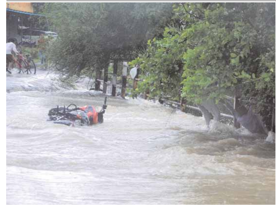
A motorcyclist being rescued after he was swept away in flood water crossing a bridge following continuous rain, at Khejda bridge near Banpur in Bhopal on Wednesday.