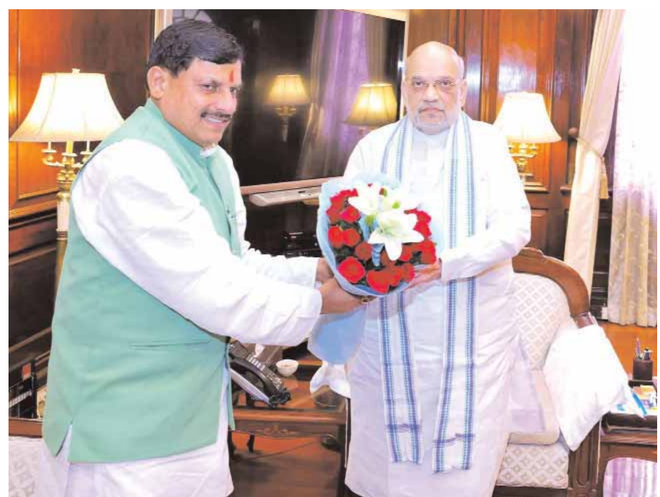
Madhya Pradesh Chief Minister Mohan Yadav with Union Home Minister Amit Shah during a meeting in New Delhi on Wednesday.

many as 4878 sub health centres were operating from rented buildings, now their number has come down to 667. At present, 965 are operating from rent-free Panchayat buildings. The number of primary health centers has increased from 1,192 to 1,440, and community health centers from 229 to 332, with 328 operating from government buildings. For the rest, construction is in progress. Sub-Health Centers: These are the first referring point for the community, providing maternal and child health services, family welfare, nutrition, vaccination and disease control. Ideally, they are managed by at least one Auxiliary Nurse Midwife, one Female Health Worker, and one Male Health Worker and cover at least four villages.