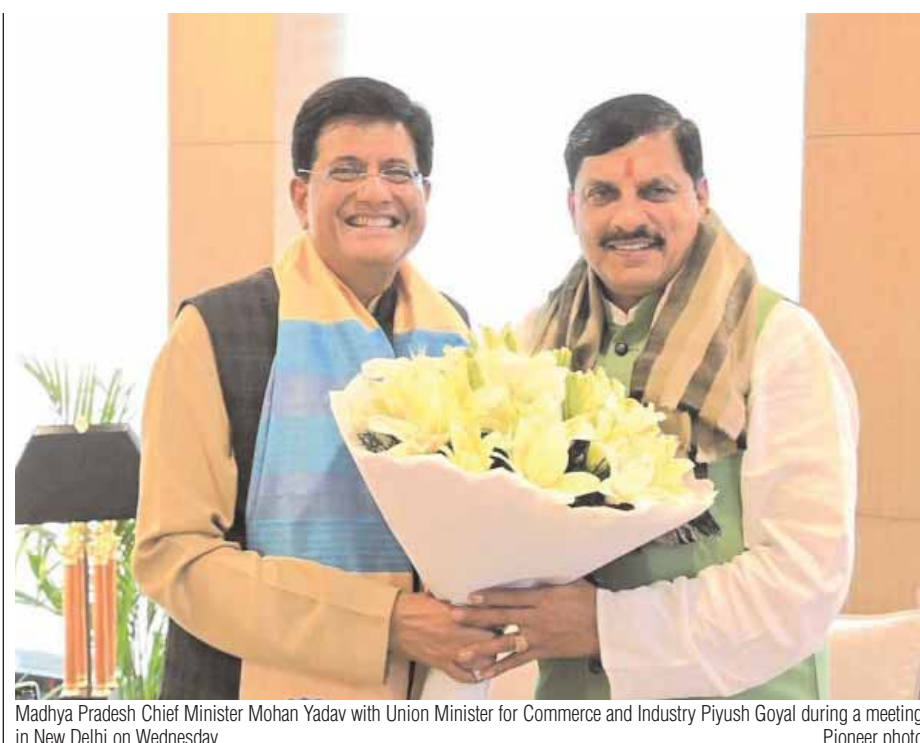
Madhya Pradesh Chief Minister Mohan Yadav with Union Minister for Commerce and Industry Piyush Goyal during a meeting in New Delhi on Wednesday.

toilets in those places. To increase participation in collective cleaning activities, apart from the identification of volunteers and participation of industrial groups, those doing outstanding work will be honored in the presence of citizens. Major programs will be held on the concluding day of the campaign The 'Swachhata Hi Seva' campaign will conclude across the state on October 2, on 'Mahatma Gandhi Jayanti'. On this day, efforts will be made to spread Mahatma Gandhi's concept of cleanliness to people. Efforts will be made to connect more and more people online with the programs being held at the national and state level. Children and youth will present literature and culture-based programs in the presence of public representatives.