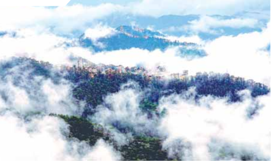
Low clouds cover the mountains after rainfall, in Shimla