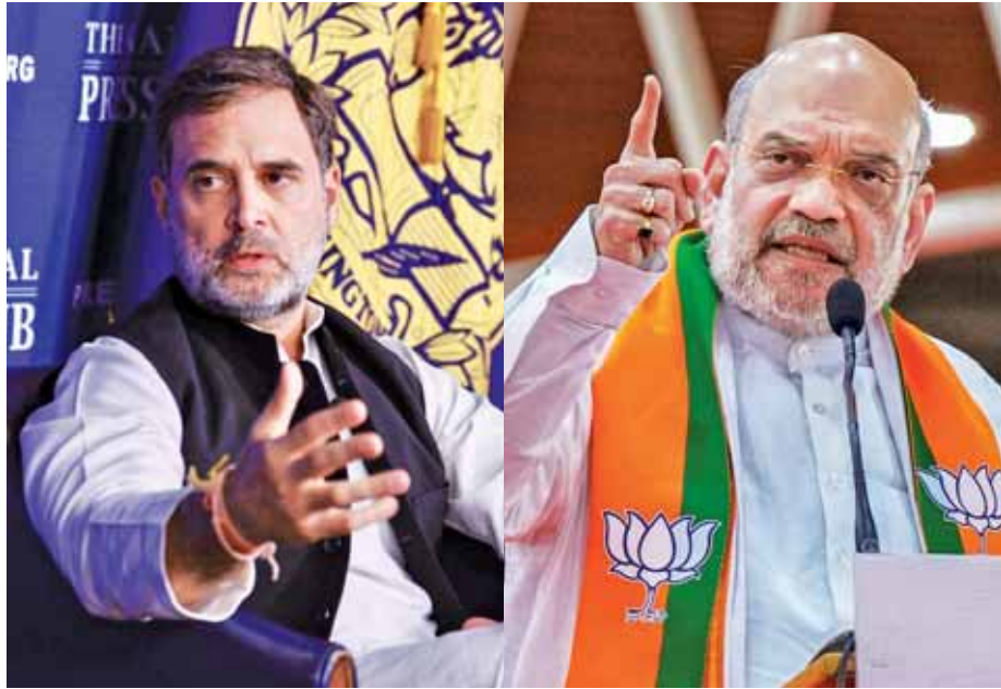
Rahul Gandhi interacts with the media at the National Press Club, in Washington DC, USA and Amit Shah condemns his anti-national statements

PIONEER NEWS SERVICE ■ NEW DELHI Yet another foreign trip by Congress leader Rahul Gandhi has stoked another round of controversy in the political circles of India and the Centre and BJP Leaders on Wednesday also commented that Rahul Gandhi's quota remark in a foreign land has exposed the Congress' "anti-reservation face" and making "anti-national statements" has become a habit for the former Congress chief. Sending a stern message to Rahul Gandhi, Home Minister Amit Shah said that as long as the BJP is there, no one can abolish reservation or mess with the nation's security. The senior BJP Leader's comments came after Rahul Gandhi told students of Georgetown University in the United States that the Congress would think of scrapping reservations when "India is a fair place", which he said is not the case right now. "Standing with forces that conspire to divide the country and making anti-national statements have