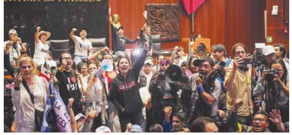
Protesters break into a Senate session in which lawmakers were debating the government's proposed judicial reform, which would make judges stand for election, in Mexico City, Tuesday.

to pass the proposal. The legislation sailed through the lower chamber, where Morena and its allies hold a supermajority, last week. The Senate posed the biggest obstacle and required defections from opposition parties. One appeared to come Tuesday from the opposition National Action Party (PAN) after a lawmaker who had previously spoken out against the overhaul took leave for medical reasons and his father, a former governor, suggested he would vote for the proposal. The Senate voted twice on the bill, both times 86-41, with the second coming around 4 am.