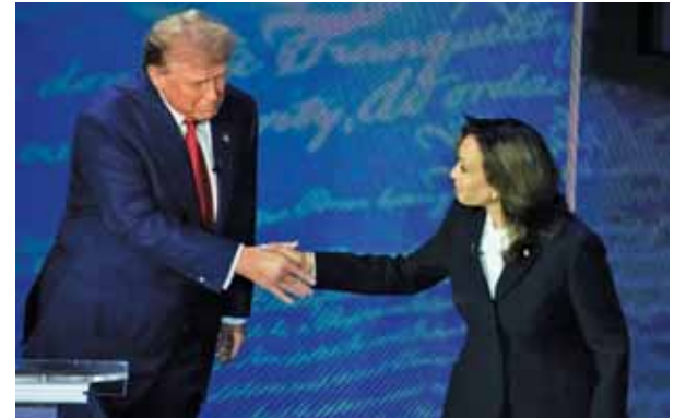
Republican presidential nominee former President Donald Trump shakes hands with Democratic presidential nominee Vice President Kamala Harris during an ABC News presidential debate at the National Constitution Center in Philadelphia

Kamala Harris pressed a forceful case against Donald Trump on Tuesday in their first and perhaps only debate before the presidential election, repeatedly goading him in an event that showcased their starkly different visions for the country on abortion, immigration and American democracy. The Democratic vice president provoked Trump with reminders about the 2020 election loss that he still denies, delivered derisive asides at his false claims and sought to underscore the Republican former president's role in the Supreme Court's overturning of a national right to abortion two years ago. Trump tore into Harris as too liberal and a continuation of Biden's unpopular administration, as he launched into the sort of free-wheeling personal attacks and digressions from which his advisers and supporters have tried to steer him away. In one moment, Harris turned to Trump and said that as vice president, she had