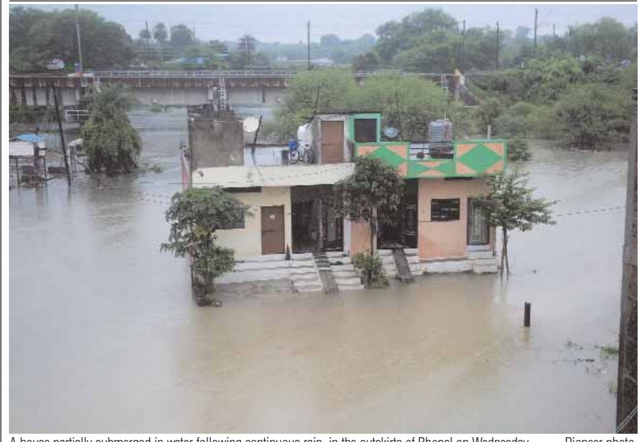
A house partially submerged in water following continuous rain, in the outskirts of Bhopal on Wednesday.