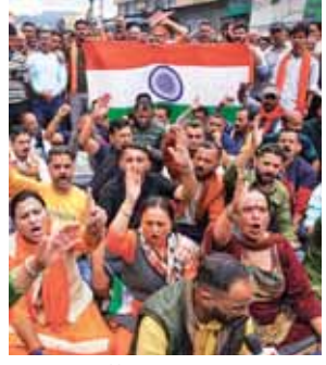
Members of Hindu organisations stage protest over illegal construction in a mosque, at Sanjauli, Shimla

army while they were attempting to infiltrate inside the Indian territory in the Laam sector of Nowshera in the frontier district of Rajouri on Monday. For the past several days, different parts of Jammu and Kashmir have been witnessing an 'unprecedented' response to the high-voltage campaigning by the candidates representing various political parties. The atmosphere in Kashmir valley is electrifying as many candidates are canvassing as late as midnight in their native villages and 'mohallas' in the urban centers amid tight security arrangements. In Jammu, unconfirmed reports indicated the BSF soldier was targeted by a sniper from across the International border. Senior BSF officials of the Jammu frontier rushed to the forward area to take stock of the ground situation.