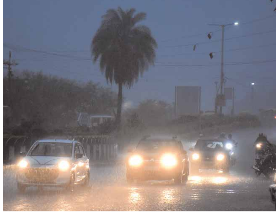
Vehicles move on road amid heavy rainfall in Bhopal on Monday.

Tuesday and Wednesday. Due to rain, the gates of all the dams of Bhopal can open again. The water in Kolar Dam, Kerwa, Bhadbhada and Kaliyasot Dam near Bhopal is close to the prescribed level.