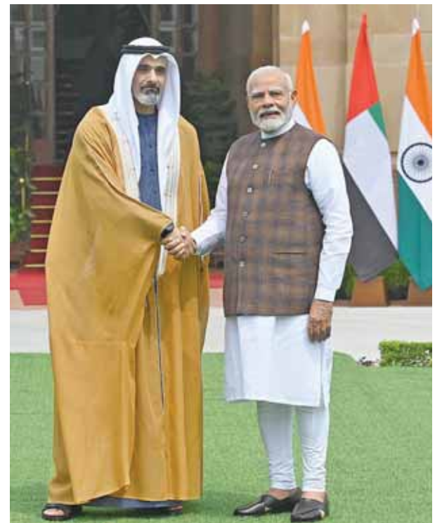
Prime Minister Narendra Modi meets Abu Dhabi's Crown Prince Sheikh Khaled bin Mohamed bin Zayed Al Nahyan at the Hyderabad House, in New Delhi, Monday

An Agreement for long-term LNG supply between Abu Dhabi National Oil Company (ADNOC) and Indian Oil Corporation Ltd and another between ADNOC and India Strategic Petroleum Reserve Ltd (ISPRL) are among the