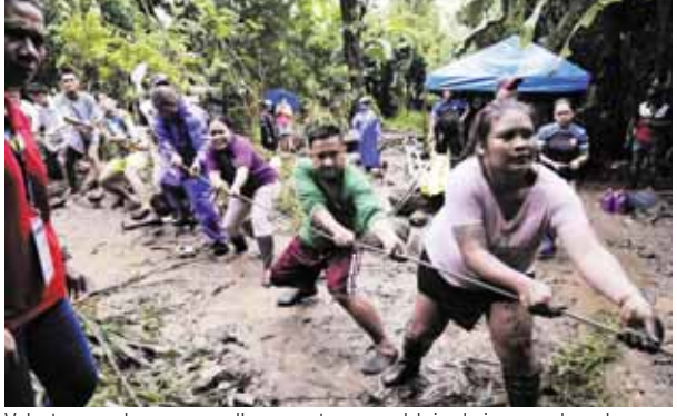
Volunteers and rescuers pull a rope to move debris during search and rescue operations for missing residents after a landslide caused by Tropical Storm Yagi locally called Enteng, hit their village at San Luis, Antipolo city, Rizal province Philippines on Tuesday.

Storm warnings remained in most northern Philippine provinces, where residents were warned of the lingering danger