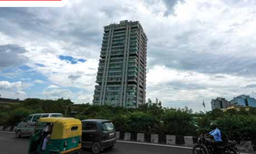
Clouds hover over the Delhi as vehicles pass by the Vikas Minar, in New Delhi