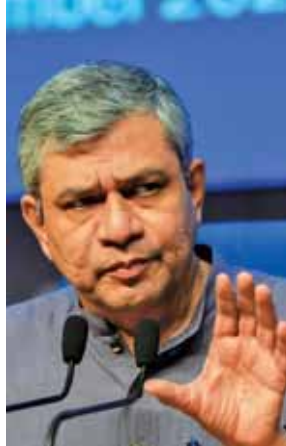
Union Minister Ashwini Vaishnav briefs the media over cabinet decisions, in New Delhi, Monday

In an effort to improve the lives of farmers and increasing their income, the Union Cabinet chaired by Prime Minister Narendra Modi on Monday approved around ₹13,966 crore outlay for seven big-ticket programmes related to the farming sector, including a ₹2,817-crore digital agriculture mission and a ₹3,979-crore scheme for crop science. These programme will focus on harnessing public-funded digital infrastructure to research focussed on emerging challenges in the farm sector. The emphasis of these programmes would be on research & education, climate resilience, natural resource management and digitisation in the agriculture sector along with emphasis on growth of horticulture and livestock sectors. Addressing a press conference after the Union Cabinet meeting, Union Minister Ashwini Vaishnav announced that the Union Cabinet, chaired by Prime Minister Narendra Modi, approved seven schemes to improve farmers' lives and increase their incomes at a total outlay of ₹13,966 crore. The Cabinet has approved crop science for food and nutritional security programmes with a total outlay ₹3,979 crore. In this programme, six pillars have been included in