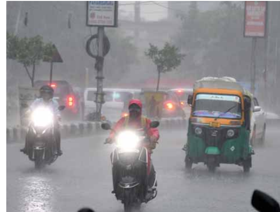
Commuters ride vehicles amid heavy rain in Bhopal on Monday.