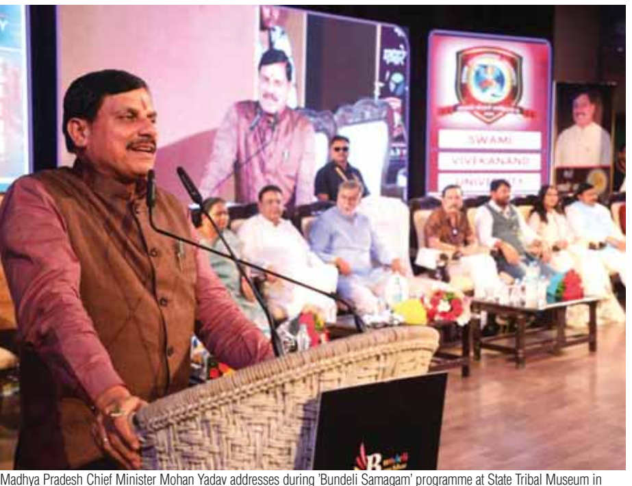
Madhya Pradesh Chief Minister Mohan Yadav addresses during 'Bundeli Samagam' programme at State Tribal Museum in Bhopal on Saturday.