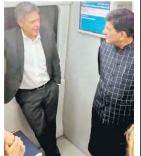
After hearing Goyal's remarks, he stood saying, "I think I should listen to you".

Habeck arrived here last week as a part of a high-level delegation led by German Chancellor Olaf Scholz. The German Vice Chancellor was sitting while Goyal was standing during the conversation.