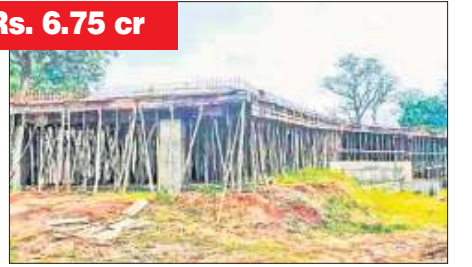
The main section of the museum is ready for slab construction.

The foundation stone for the museum was laid in October 2021 with an estimated budget of Rs 35 crore, with the Central government contributing Rs. 15 crore and the State government allocat-