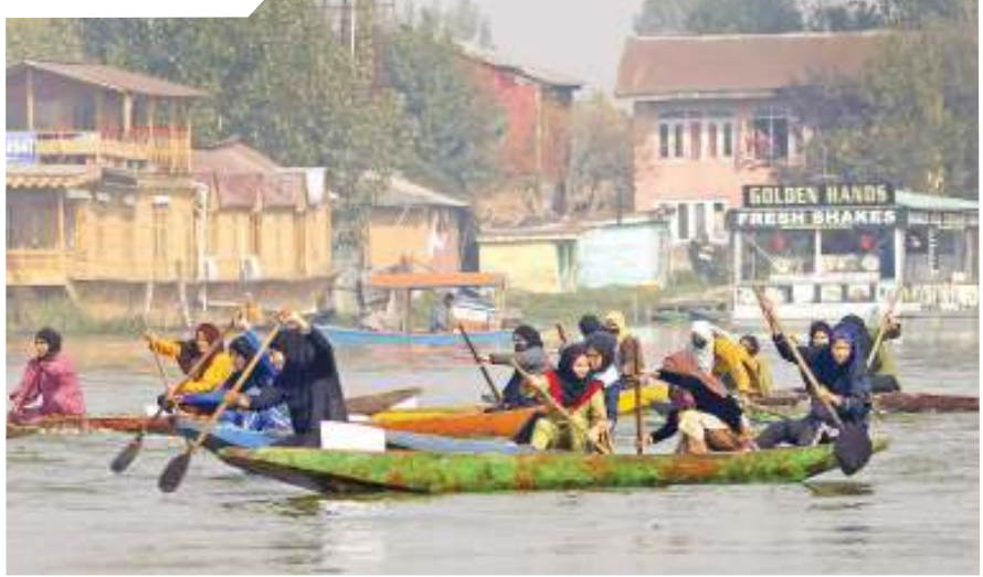
Women compete in a boat race at the Dal Lake, in Srinagar