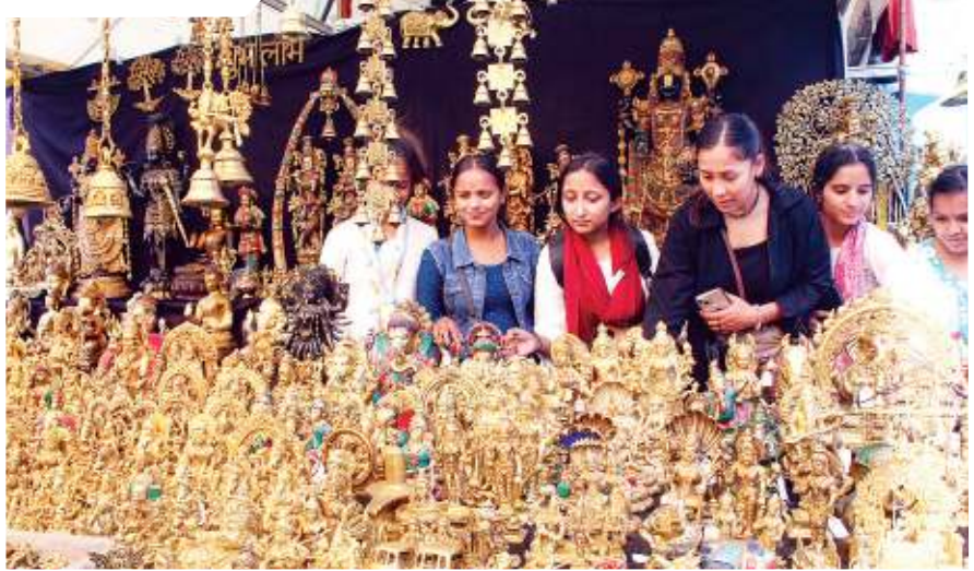
Visitors at the Virasat Mahotsav 2024, an art and heritage festival, in Dehradun