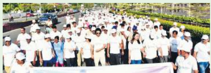
Actor Sudhir Babu taking part in the Walkathon organised by the Income Tax Department in Vijayawada on Sunday