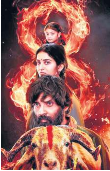
film. "I had to get the language because the story is set in the 1980s in interiors, so I did homework during dubbing to get the right slang. Another challenge was for the 'Pothuraju' get-