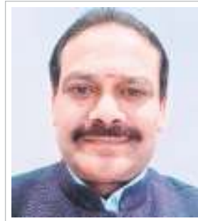
DR. ARJA SRIKANTH (Former Special Secretary, Government of Andhra Pradesh)

2 lakh per shop. There is no limit on how many licences an individual can hold, which could either democratize the market or lead to monopolies. To sweeten the deal, the state is introducing low-cost liquor priced as low as Rs 99 to undercut black-market operations. Retailers are promised a 20% margin on liquor sales, but they will also face a steep annual retail excise tax (RET) ranging from Rs 5 lakh to Rs 8.5 lakh, depending on the size of the town or city. In the