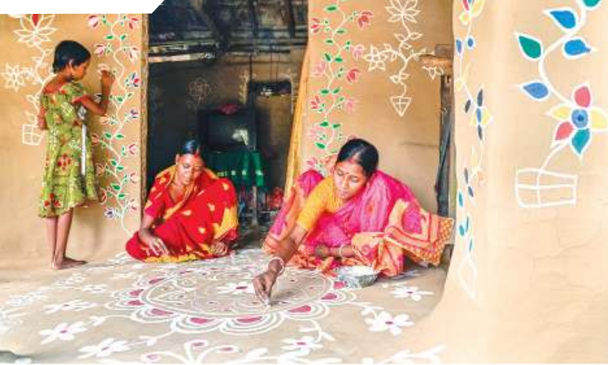
Women make 'rangoli' on the occasion of Lakshmi Puja, in Nadia