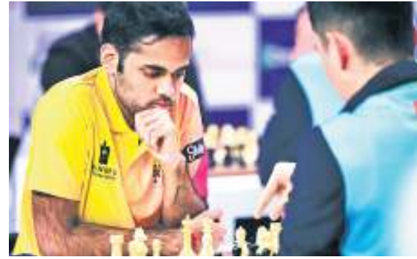
the World number four Indian but eventually crumbled in the Armageddon. The first game ended in an easy draw for Arjun as black, while the second game