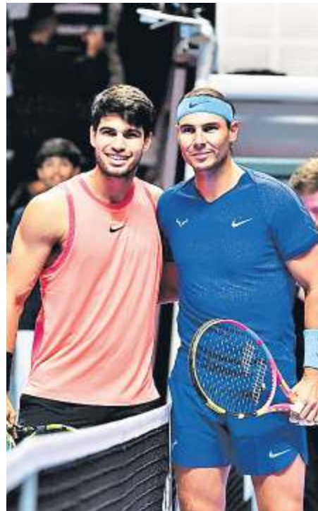
has appealed that exoneration. Djokovic and Sinner met for real on Sunday, when the Italian won in straight sets for the Shanghai Masters title.

With an eye on the Davis Cup, Rafael Nadal said he was pleased with his performance despite losing 6-3, 6-3 to Carlos Alcaraz at the Six Kings Slam. Jannik Sinner beat Novak Djokovic 6-2, 6-7 (0), 6-4 in the other semifinal at the exhibition event that awards money but no ATP ranking points and is Saudi Arabia's latest foray into tennis. The match against Alcaraz was Nadal's first since he announced last week that he would be retiring after playing for Spain in the Davis Cup next month. Nadal and Alcaraz played doubles together at the Paris Games and could team up again for the Davis Cup. "I have the Davis Cup in front (of me) in a month so every day is an opportunity to be better and better and be ready for this final tournament of my career," Nadal said. "I want to try my best to be ready for that and help the team in some way." Thursday's match was the first contest for Nadal since his exit at the Paris Olympics in July. "Carlos was too good. I haven't been on the competitive stage since a couple months ago," Nadal said. "So yeah I think it was a good performance, even if it was not enough to play against an animal like him. But it was a positive match for me and I'm happy." Nadal will play Djokovic on Saturday in a third-place match before Sinner faces Alcaraz. The top-ranked Sinner was cleared in a doping case shortly before winning last month's U.S. Open, although the World Anti-Doping Agency