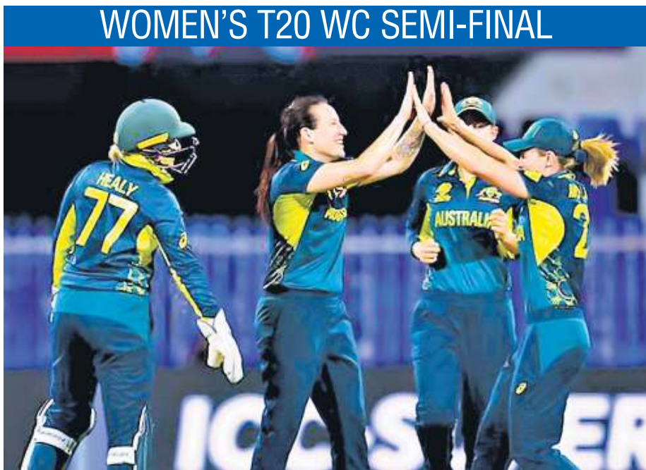
Women's T20 World Cup is even more intimidating as Australia have won all the

Australia will start as overwhelming favourites in their quest for an unprecedented eighth final appearance when they take on South Africa in the semi-final of the ICC Women's T20 World Cup here on Thursday. Australia have now made it to the semi-finals of the global T20 tournament in all its nine editions held so far since 2009 in England. The six-time champions take on the Proteas women in a last-four clash in what seems to be a repeat of the summit showdown during the 2023 edition in South Africa, which the Southern Stars won by 19 runs. Going by pure statistic, South Africa are no match for Australia who have won nine out of the 10 WT20I games, with the former's only win coming in January this year. The head-to-head record at