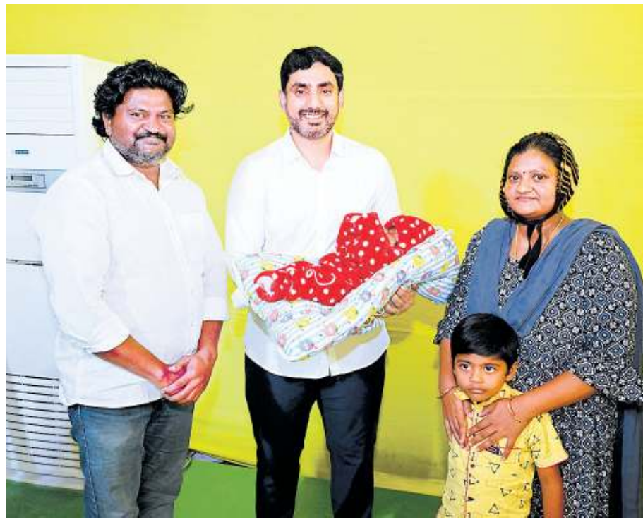
After 14 days of intensive care, the infant made a full recovery and returned home healthy.

At the public grievance programme held the next morning, Maheshwar Rao met Minister Lokesh and pleaded