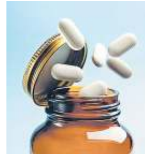
Drugs Controller of India's regulatory body for drug control, regarding the quality and safety in the pharma sector,