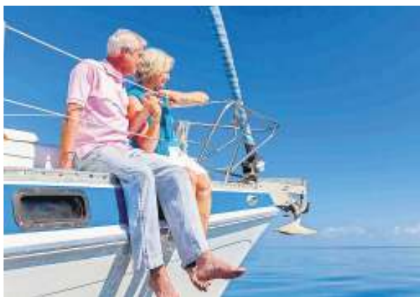
urban Indian working women have begun investing for retirement, it said.

The study also highlights regional opportunities in retirement planning across India, with the east zone lead-