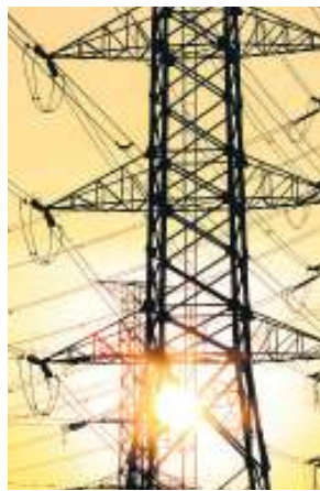
2035 and become the main source of oil demand growth in the world. According to IEA projections, the country is on track to become the third-largest economy in the world by 2028. It was the world's fifth

India, the world's third largest oil consuming and importing nation, will see its demand for oil rise by almost 2 million barrels per day by