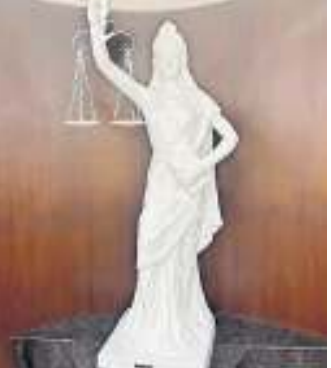
technology for live transcription of such hearings of national importance. The judicial hearings in the NEET-UG matter and R.G. Kar Medical College and Hospital suo moto case garnered huge public views.