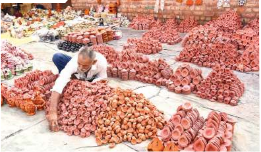
A vendor arranges earthen lamps (Diya) for sale, in Bikaner