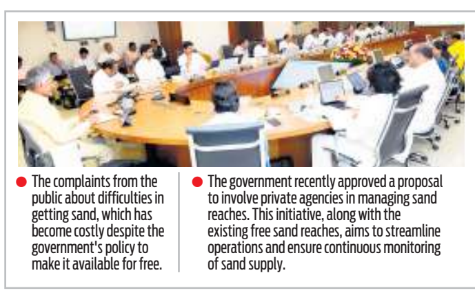
● The complaints from the public about difficulties in getting sand, which has become costly despite the government's policy to make it available for free. ● The government recently approved a proposal to involve private agencies in managing sand reaches. This initiative, along with the existing free sand reaches, aims to streamline operations and ensure continuous monitoring of sand supply.

PNS ■ VIJAYAWADA Chief Minister N Chandrababu Naidu has made it clear that party leaders' intervention in free sand will be dealt with seriously as such actions are damaging the government's reputation. During the Cabinet meeting held at the Secretariat in Velagapudi, Amaravati, on Wednesday, Chandrababu stated that negligence in implementing the free sand policy will not be tolerated. After addressing the Cabinet agenda, the Chief Minister discussed political issues specifically focusing on the challenges surrounding the free sand policy. He expressed concern over the complaints from the public about difficulties in getting sand, which has become costly despite the government's policy to make it available for free. The Chief Minister reminded the ministers that the free sand policy was introduced to ensure that sand is easily accessible to the common man and middle-class families, reducing the financial burden of house construction. He emphasised that the policy's primary goal is to serve the real beneficiaries -- the common people -- and that delays or inefficiencies will not be acceptable.