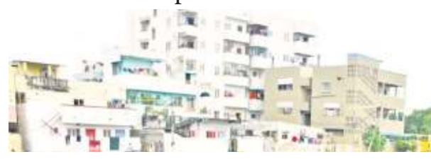
The alumni members of the SRR & CVR Government Degree College visiting the encroached land beside BRTS road in Vijayawada on Monday

The alumni reported that some individuals recently