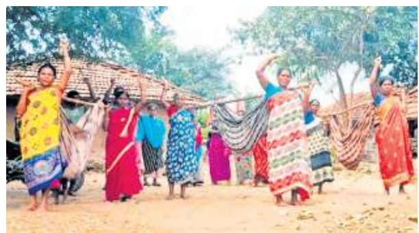
Tribals of Nakkalamamidi in a remote village in Kivarla gram panchayat protesting for roads

Despite exercising their right to vote, the villagers remain on