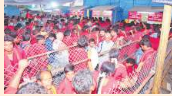
Bhavani devotees waiting in queue lines at the Kanaka Durga Temple in Vijayawada on Monday, to relinquish their Deeksha

Rush leads to traffic congestion on several roads in city