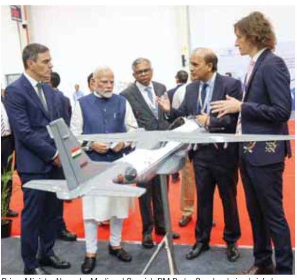
Prime Minister Narendra Modi and Spanish PM Pedro Sanchez being briefed about an aircraft as they visit the TATA Aircraft Complex after its inauguration, in Vadodara, Gujarat, Monday, October 28, 2024. Tata Sons Chairperson Natarajan Chandrasekaran is also seen

India on Monday set in motion the manufacture of C295, an ultra modern tactical transport aircraft which can carry troops and logistical supplies from main airfields to forward operating airfields of the country. The aircraft will be made in partnership with Spain, and can also operate on short unprepared airstrips as it is capable of Short Take-off and Landing (STOL). The aircraft can additionally be used for casualty or medical evacuation, performing special missions, disaster response and maritime patrol duties while it can operate from short airstrips just 2,200 feet long and can fly low-level operations for tactical missions flying at a low speed of 110 knots according to parent manufacturer Airbus. Prime Minister Narendra Modi and his Spanish counterpart Pedro Sanchez inaugurated the Tata Aircraft Complex in Vadodara, India's first private facility to build these military planes, where C295 aircraft will be produced. PM Modi and Spanish PM Pedro Sanchez on Monday inaugurated the Tata Aircraft Complex for manufacturing C295 aircraft in Vadodara. Noting that the partnership between India and Spain is finding a new direction, Modi said the project would not only strengthen the relations between the two nations but also give momentum to the mission of 'Make in India, Make for the World'. PM Modi conveyed his best wishes to the team of Airbus and Tata, and also paid tributes to the late Ratan Tata. The Airbus C295 is a medium tactical transport aircraft that