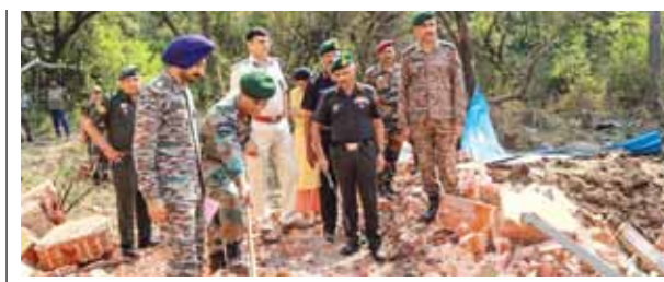
Officials at the blast site of Ordnance Factory Jabalpur (OFJ), in Jabalpur district, Madhya Pradesh, Tuesday