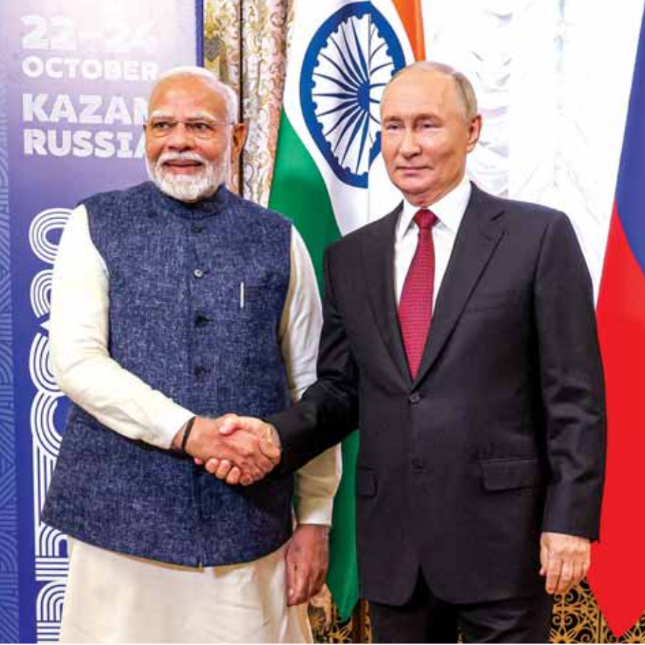
Prime Minister Narendra Modi during a bilateral meeting with Russian President Vladimir Putin, in Kazan, Tuesday

PTI ■ KAZAN The Russia-Ukraine conflict should be resolved in a peaceful manner and India is ready to provide all possible cooperation towards it, Prime Minister Narendra Modi said on Tuesday during his talks with Russian President Vladimir Putin. Modi held bilateral talks with Putin hours after arriving in this central Russian city to attend the 16th BRICS summit. In his televised opening remarks, the Prime Minister conveyed to the Russian leader that New Delhi "fully supports" the early return of peace and stability in the region. Modi also said that his second visit to Russia in the last three months reflected "close coordination and "deep trust" between the two countries. "We are in constant touch on the issue of ongoing conflict between Russia and Ukraine. As I said earlier, we believe that problems should be resolved in a peaceful manner," the Prime Minister said. "We fully support the early return of peace and stability. All our efforts give priority to