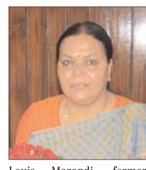
PNS : RANCHI