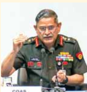
Chief of the Army Staff General Upendra Dwivedi during a press conference, in New Delhi

humanity. India is ready to provide all possible cooperation in times to come," he said. "We have the opportunity to discuss all these issues," he added. On his part, Putin noted the "good condition" of trade turnover between Russia and India. In his remarks, Modi also referred to his summit talks with the Russian leader in Moscow in July. Our annual summit resulted in strengthening cooperation in every field, he said. The Prime Minister also congratulated Putin on Russia's successful presidency of BRICS. Many countries want to join the grouping now, he added. "It is a matter of great pleasure for me to have the opportunity to visit a beautiful city like Kazan for the BRICS summit. India has deep and historical ties with this city," Modi said. "The opening of India's new consulate in Kazan will further strengthen these ties," he added. It is learnt that the Ukraine conflict figured prominently at the meeting. In the summit talks on July 9 in Moscow, Modi told Putin that a solution to the Ukraine conflict is not possible on the battlefield and peace efforts do not succeed in the midst of bombs and bullets. Weeks later he travelled to Ukraine. In his talks with Zelenskyy, Modi said both Ukraine and Russia should sit together without wasting time to end the ongoing war and that India was ready to play an "active role" to restore peace in the region. India has been maintaining that the conflict in Ukraine must be resolved through dialogue and diplomacy.