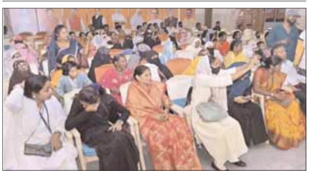
Dozens of muslim women join Bharatiya Janata party in presence of State BJP President Babulal Marandi at the party office in Ranchi on Tuesday.

PNS : RANCHI More than a hundred of Muslim women on Tuesday joined the BJP at the BJP state office. In a function organized at the state party office, state president and former chief minister Babulal Marandi welcomed them into the party and got them enrolled.