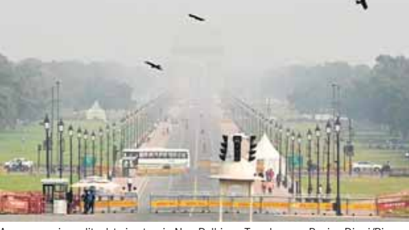
A smog as air quality deteriorates, in New Delhi, on Tuesday

Even before the arrival of winter, Delhi along with several cities of north India is gasping for clean air as air quality has degraded to alarming levels over the past few days. Based on the real time data, Delhi ranks top on the list of most polluted cities in the world on Tuesday, a live ranking on IQAir's a Swiss based air quality monitoring website indicated, after only Lahore in neighbouring Pakistan. AQI in Lahore recorded 394. A layer of smog engulfed Delhi and surrounding areas, including Noida, on Tuesday morning, even as the air quality plummeted to the 'very poor' category at 327, followed by Haryana's Jind where the AQI stood at 311. Meanwhile, out of 36 monitoring stations in the National Capital, 26 are in the red zone, with the AQI recorded in the "very poor" category, according to data from the Central Pollution Control Board. These stations