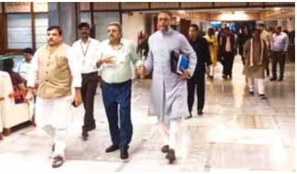
Members of Joint Parliamentary Committee on Waqf (Amendment) Bill leave after a meeting at Parliament House Annex, in New Delhi, Tuesday

PIONEER NEWS SERVICE ■ NEW DELHI In a bizarre incident, All India Trinamool Congress Member of Parliament Kalyan Banerjee created a ruckus during a crucial Waqf meeting in Parliament on Tuesday where he smashed a glass water bottle and hurled it towards the Chair. Banerjee injured himself and jeopardised the safety of other