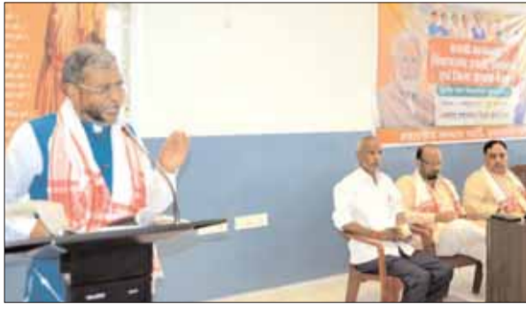
BJP State President Babul Marandi alongwith others during a meeting with party leaders in Dhanbad on Monday.

Meanwhile, in other development BJP State President and former Chief Minister Babul Marandi said that familyism means the party's identity is with the family and the party is run by the family. In the country, the Congress party is identified and run by the Gandhi family. In Jharkhand, the JMM is identified and run by Shibu Soren's family. In Bihar, the Rashtriya Janata Dal is iden-