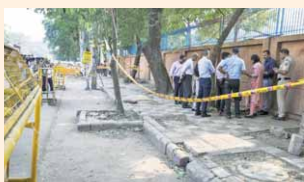
NIA and Delhi Police officials investigate at the site where a blast occurred on Sunday, near a CRPF school at Prashant Vihar, in Rohini area of New Delhi

year in Galwan. Twenty Indian army personnel including the commanding officer died in the clash while more than 40 Chinese troops were also killed. Both the sides then amassed troops and weaponry on their respective sides of the LAC. In fact, India, not willing to take any chances, also deployed its troops even during the winter months at the LAC. Earlier, the troops used to withdraw to their bases during the winters. At one point of time, more than 50,000 troops from each side were facing each other on friction points at the LAC. Given the situation, India and China, since 2020, held several rounds of talks at the military and diplomatic levels. While Corps Commanders of the two sides held military level talks, the diplomatic level talks were held under the aegis of Working Mechanism for Consultation and Coordination (WMCC) on India-China Border Affairs.