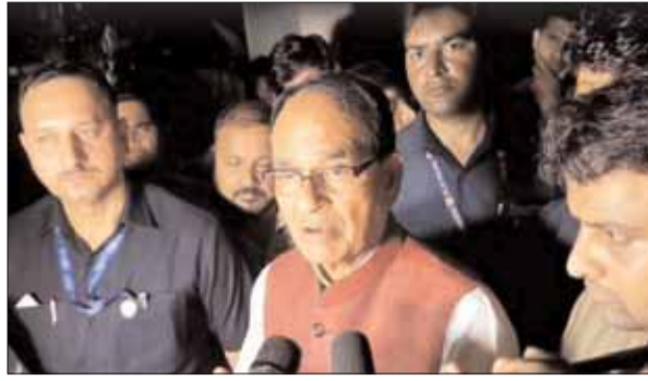
BJP's state election in-charge-cum Union Minister Shivraj Singh speaking to media persons in Ranchi on Monday.

Marandi said that Jharkhand Mukti Morcha