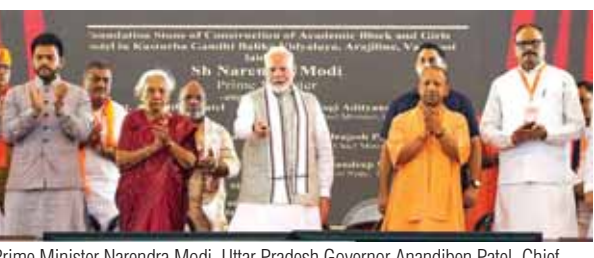
Prime Minister Narendra Modi, Uttar Pradesh Governor Anandiben Patel, Chief Minister Yogi Adityanath and others during the inauguration of various projects at the newly-constructed stadium at Sriga, in Varanasi, Sunday