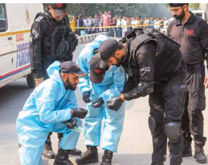
National Security Guard (NSG) personnel conduct investigations at the site of the blast at Prashant Vihar, near the CRPF school in Rohini area of New Delhi on Sunday