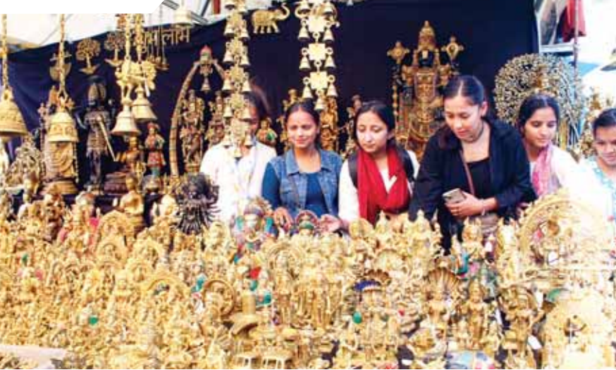
Visitors at the Virasat Mahotsav 2024, an art and heritage festival, in Dehradun