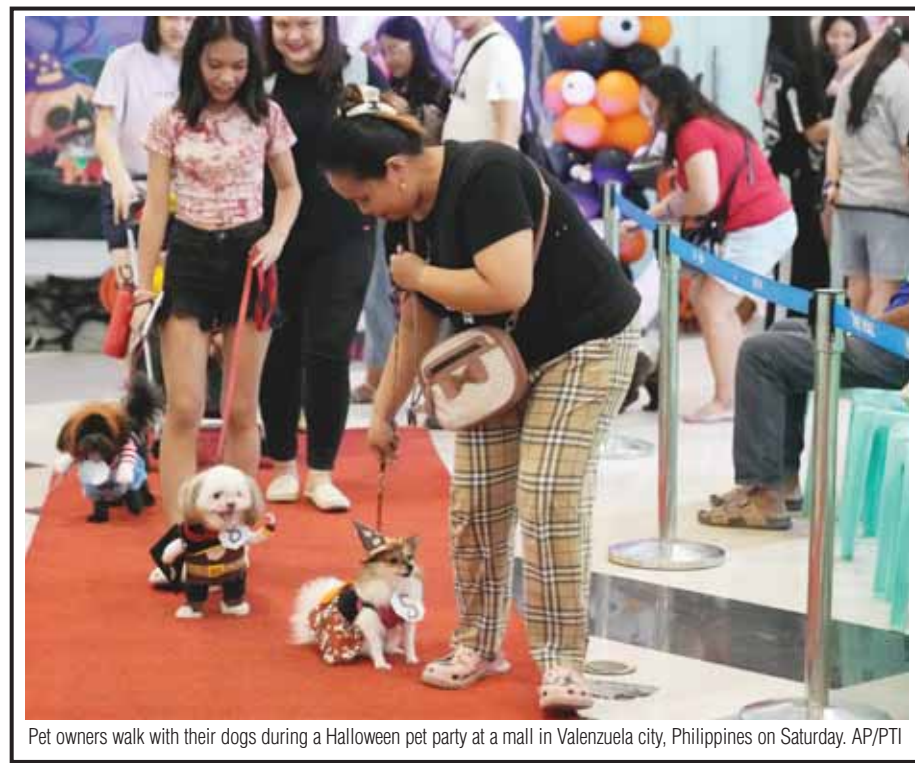
Pet owners walk with their dogs during a Halloween pet party at a mall in Valenzuela city, Philippines on Saturday.

polio eradication. Of the 37 cases detected from across Pakistan so far this year, the official said, 20 have been reported from Balochistan, 10 from Sindh, five from KP, and one each from Punjab and Islamabad. "Genetic sequencing of the cases is underway," he disclosed. "These were the first polio cases from Noshki and Lakkhi Marwat this year," he said, adding that both Chaman and Pishin had reported one poliovirus case each earlier as well. Officials claimed that the fight against poliovirus in Balochistan and southern KP suffered in 2023 and early 2024, as immunisation campaigns were either staggered or postponed due to localised protests.