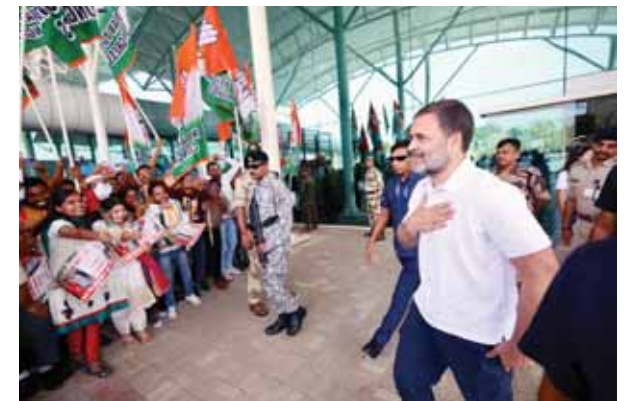
Leader of Opposition in Lok Sabha Rahul Gandhi greeted by people during his arrival at Birsam Munda Airport in Ranchi on Saturday.

The Senior Congress Leader said if this thinking is of Birsam Munda ji's thinking, of Guru Nanak's thinking, then who is against it, it is Manusmriti. "This is not a new fight. This fight has been going on for thousands of years. Ambedkar said educate. What does it mean? Know your rights, know the constitution. If a youth today understands physics very well, he will be called educated. Ambedkar's meaning of educate was who are you, where do you stand, what is happening around you, who is doing what, this is what is meant by educate. Educate does not mean that you have gone to college and you do