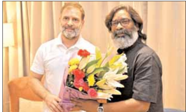
Chief Minister Hemant Soren presents a bouquet to Leader of Opposition Rahul Gandhi during a meeting in Ranchi on Saturday.

JMM, Congress to contest on 70 seats, RJD and left on rest 11