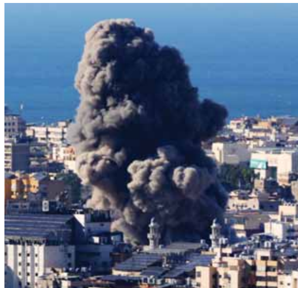
Smoke rises from an Israeli airstrike on Dahiyeh, in the southern suburb of Beirut, Lebanon, on Saturday.