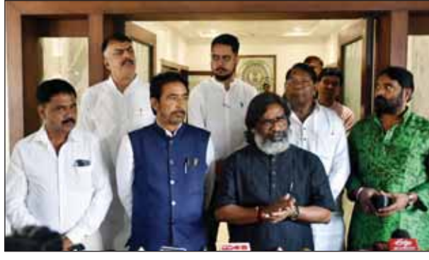
Chief Minister Hemant Soren and Jharkhand Congress in-charge Ghulam Ahmed Mir during a press conference at his official residence in Ranchi on Saturday.

Soren shared that other allied parties within the INDI coalition would compete for the remaining 11 seats. According to sources, JMM will field candidates in 41 constituencies, while the Congress will contest 29 seats.