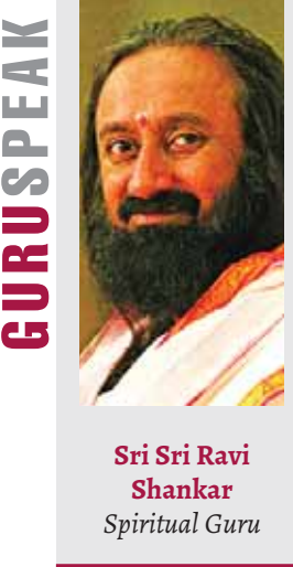
Sri Sri Ravi Shankar Spiritual Guru

There are 365 days in a year and there are so many years in your life. If for one or two days you feel you are wasted, life is a failure, it's okay, never mind!