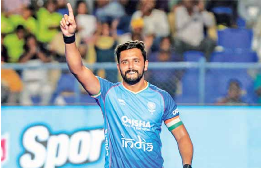
the combination of the squad, insisting that they managed to get the perfect balance. "We have a very good-looking team at the Soorma Hockey Club at the end of the auction, the owners and coaching staff have hit the ball out of the park. We have the perfect balance of experienced, big-name players and young players with the potential to become big names themselves," Harmanpreet said.

On the edge of his seat during Hockey India League (HIL) auctions, India's Olympic medal-winning skipper Harmanpreet Singh was silently praying that Sardar Singh from Soorma Hockey Club makes a winning bid for him. Eventually his wish came true with Harmanpreet becoming the costliest buy in the men's section as Soorma Hockey Club, representing Punjab and Haryana, secured his services for a whopping Rs 78 lakh on the first day of the three-day auction. "I am elated that the Hockey India League is back and in marvellous fashion. I was on the edge of my seat when my name came up during the auction, mentally hoping and urging Sardar Singh to bid for me and I get to play for the Haryana-Punjab region," said Harmanpreet, who led India to the bronze medal at the Paris Olympics. "It was a great relief when Soorma Hockey Club finally landed me in the auction and I could not have been happier," he added. The men's HIL will feature eight teams, while the inaugural women's event will have four teams. The ace drag-flicker was happy with