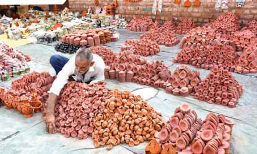
A vendor arranges earthen lamps (Diya) for sale, in Bikaner