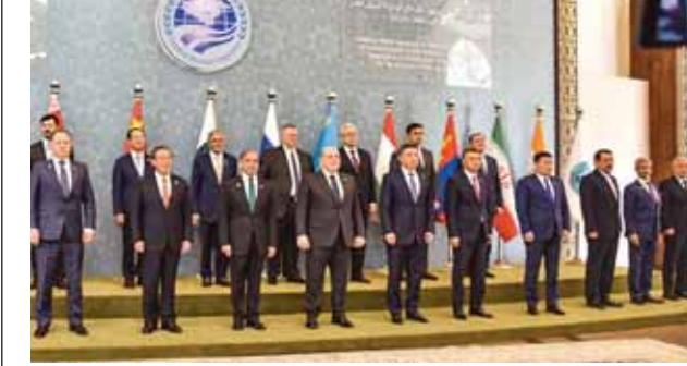
External Affairs Minister S Jaishankar with Pakistan Prime Minister Shehbaz Sharif and other leaders during the 23rd meeting of the SCO Council of Heads of Government, in Islamabad, Pakistan, Wednesday