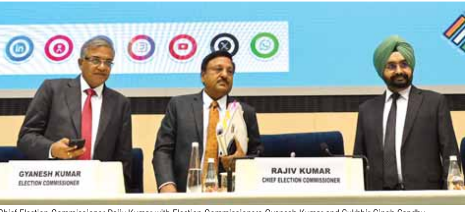
Chief Election Commissioner Rajiv Kumar with Election Commissioners Gyanesh Kumar and Sukhbir Singh Sandhu