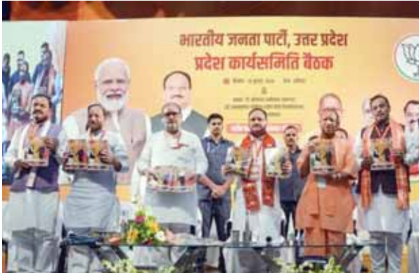
2024 Lok Sabha elections from Mirzapur. The Bahujan Samaj Party (BSP) has also announced its candidates for most of the constituencies, adding another dimension to the contest. With multiple parties vying for influence over key regions, the by-elections are emerging as a critical test of the evolving political dynamics in Uttar Pradesh. Key Constituencies in Focus Karhal (Mainpuri): The Karhal seat, situated in Mainpuri district, became