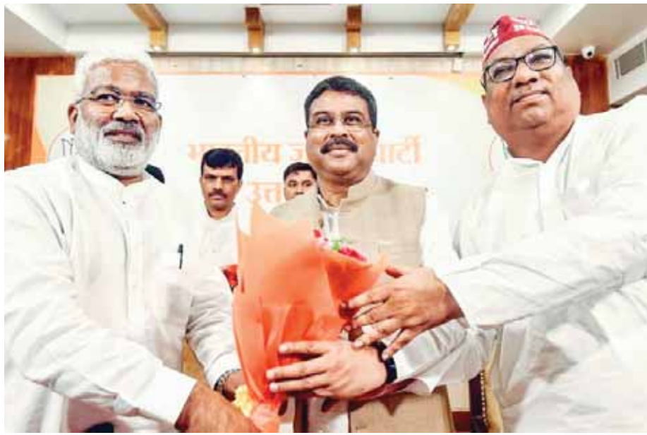
...cating the situation with the Nishad Party. An official announcement of BJP's candidates is expected soon, and the dates for the by-elections are likely to be declared within a few days. Sources indicate that the central leadership, after thorough discussions with the BJP Core Committee, finalized the list of candidates based on a panel

Nishad claims should be allocated to his party, as they were in the 2022 assembly elections. Union Home Minister Amit Shah has directed the three BJP leaders to engage in discussions with Sanjay Nishad in hopes of reaching a compromise. However, sources suggest that the BJP is inclined to offer only one seat to the Nishad Party, and that too with the condition that the candidate would contest under the BJP symbol. This proposal has reportedly not been well-received by Sanjay Nishad, who has yet to agree to the offer. The BJP finalized its strategy for the by-elections in a high-level meeting held in Delhi on Sunday. The party has decided to contest nine of the ten assembly seats, with the Meerapur seat being reserved for its ally, the RLD. Meerapur, historically an RLD stronghold, has been given back to the party for the by-elections, further compli-