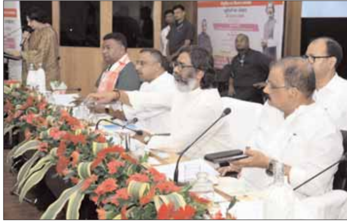
Chief Minister Hemant Soren, Ministers Mithilesh Thakur, Satyanand Bhokta and Banna Gupta during online foundation stone laying ceremony of the proposed Jharkhand Bhawan in Mumbai and 220/33 KV Grid-Sub Station, Pakribarwadhih, in Ranchi on Monday.