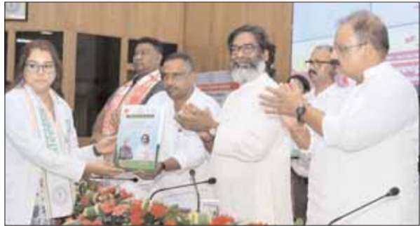
Chief Minister Hemant Soren hands over appointment letters to a newly appointed community health officer at the appointment distribution ceremony at the Jharkhand Ministry on behalf of the Department of Health, Medical Education and Family Welfare in Ranchi on Monday.

PNS : RANCHI The caravan of appointments in the State is continuously moving forward. There will not be any month when the appointment letter distribution ceremony is not organized. About 500 community health officers are getting appointment letters. In this way, now all of you will fulfill your responsibilities as an integral part of the government," said Chief Minister Hemant Soren while addressing the appointment letter distribution ceremony organized by the Department of Health, Medical Education and Family Welfare in the Jharkhand Ministry on Monday. On this occasion, the Chief Minister also laid the foundation stone of the proposed Jharkhand Bhawan in Mumbai and 220/33 kV Grid-Sub Station Pakribarwadhih online and expressed commitment to achieving self-reliance in the field of energy. The CM told the community health officers who received the appointment letters that Jharkhand is counted among the poorest and backward states of the country. "You have been appointed to improve the health care system. All of