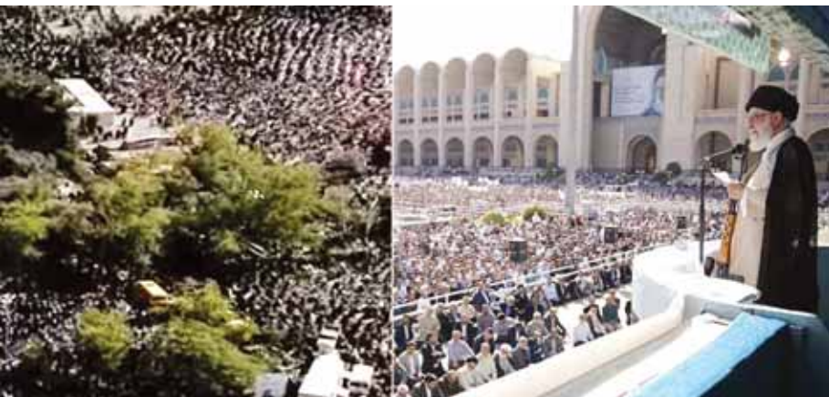
TEHRAN/ BEIRUT

Iran's supreme leader on Friday praised the country's recent missile strike on Israel and said it was ready to do it again if necessary, state TV reported. Ayatollah Ali Khamenei, in his first appearance as leader, in about five years, at Friday prayers, called the missile strike a "shining" job by Iran's armed forces. On the other hand Israel carried out a series of massive airstrikes overnight, hitting suburbs of Beirut and cutting off the main border crossing between Lebanon and Syria for tens of thousands of people fleeing Israeli bombardment. The Israeli military said Friday