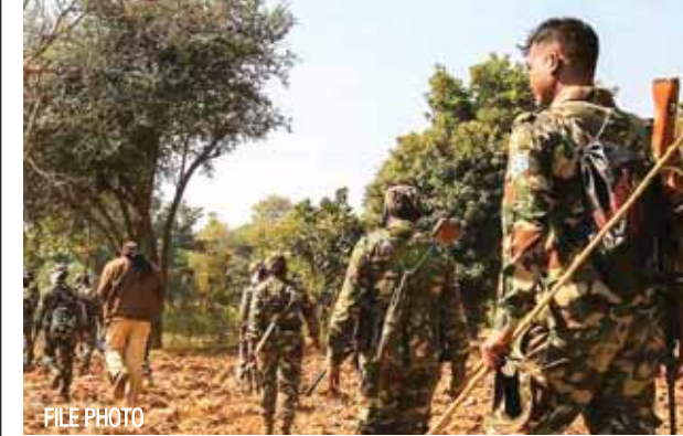
PIONEER NEWS SERVICE ■ DANTEWADA/NEW DELHI

In the largest such operation in Chhattisgarh's 24-year history, at least 30 Maoists were gunned down in an encounter with security forces in Abujhmad, Dantewada district, on Friday. The gunfight broke out at around 1 pm in the forest between Thulthuli and Nendur villages in Abujhmad on the Narayanpur-Dantewada inter-district border, when a joint team of security personnel was out on anti-Naxal operation. According to the police, the Districts Reserve Guards (DRG) from Dantewada and Narayanpur, acting on specific intelligence inputs on the presence of Maoists in the area, set out on an operation from different police camps. The DRG is a specialised force that includes Maoists who have