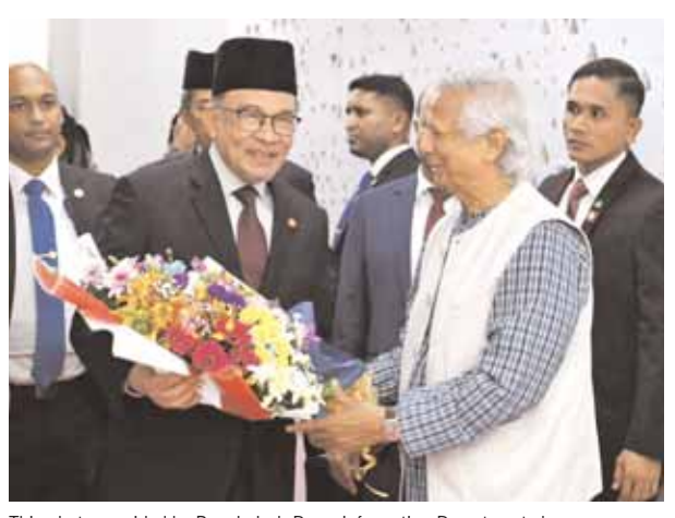
This photo provided by Bangladesh Press Information Department shows Malaysian Prime Minister Anwar Ibrahim, left, speaking with Bangladesh's interim leader Muhammad Yunus, in Dhaka, Bangladesh, Friday.

Malaysian Prime Minister Anwar Ibrahim arrived in Bangladesh's capital on Friday to meet with interim leader Muhammad Yunus, who took over in August after the former prime minister fled during a mass uprising. Anwar's hours-long visit will focus on trade and investment, migrant workers and the Rohingya refugee crisis, officials and media reports said. Yunus received Anwar in Dhaka's Hazrat Shahjalal International Airport where he was welcomed with gun salutes and a red carpet reception. It is the first visit by a foreign leader to Bangladesh since