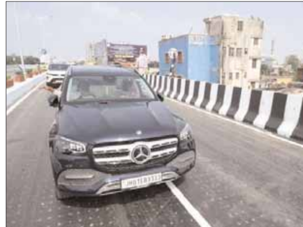
Chief Minister Hemant Soren drives his official vehicle on the newly built Kantatoli flyover after the inauguration ceremony in Ranchi on Friday.

Department at Saint Paul Cathedral Ground, Sirmatoli, Ranchi on Friday. The CM said that for this flyover to serve the residents of the capital in a better way, it is necessary that the pillars, street lighting etc. installed in this flyover are properly arranged. He said that sometimes people start encroaching places without any reason. They damage govern-