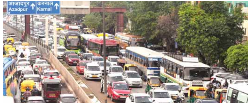
A Traffic Jam Vehicles move on road at isbt kashmiri gate