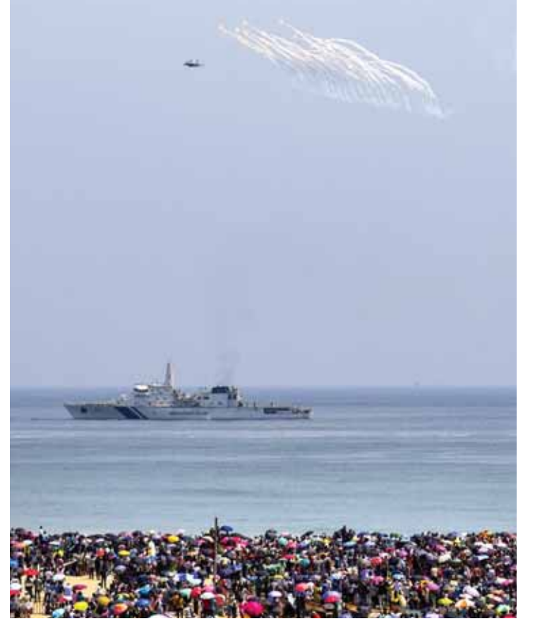
People watch the final rehearsal of Indian Air Force (IAF) aircrafts ahead of its 92nd anniversary celebrations, in Chennai